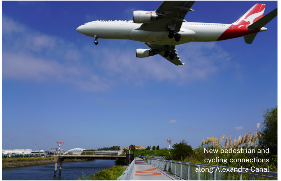
New pedestrian and cycling connections along Alexandra Canal