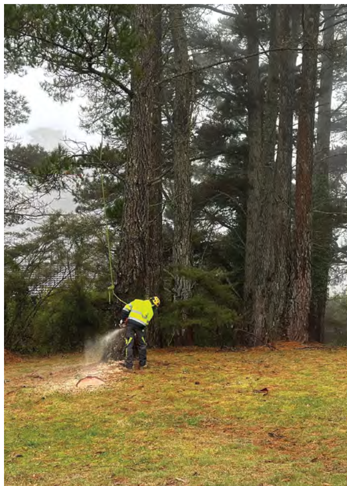
Pine tree removal underway to improve access for properties on the highway