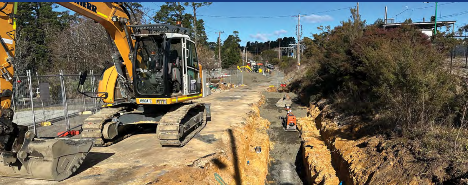
Drainage work on Railway Parade

Together, the Australian Government and the NSW Government are investing $174.4 million towards the Medlow Bath Upgrade.