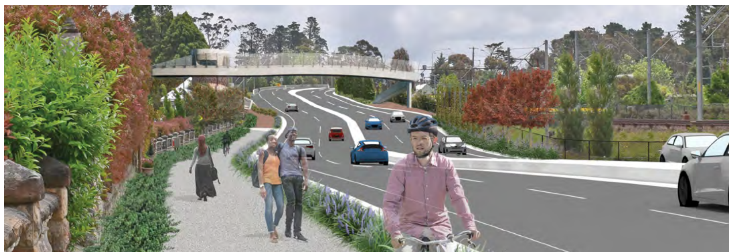
Visualisation of the selected pedestrian bridge design which travels over the highway via stairs and a lift on the western side and a ramp on the eastern side

The pedestrian bridge and station upgrade are scheduled for completion in early 2025. A site compound for the station upgrade and pedestrian bridge has been set up next to the Rural Fire Service building.