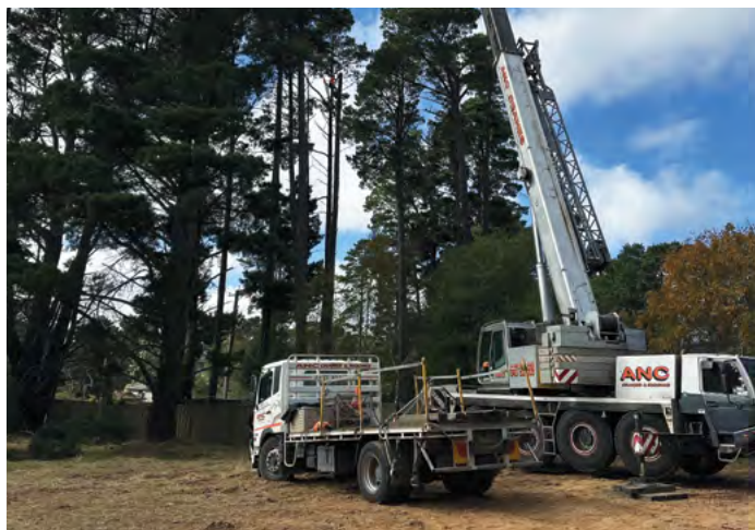
Tree removal underway at the site compound

We will mulch during the day to reduce noise at night. There is no planned work on Sundays or public holidays. After the roadworks are complete, the focus will shift to planting along the median and verges of the highway, along Railway Parade near the café and railway station and at the sediment basin.