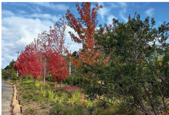
Landscaping on Railway Parade

We will maintain the area for two years to ensure the new garden beds become well established, before handing back to council to maintain thereafter.