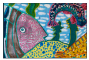
EMILY CROCKFORD - ARTIST