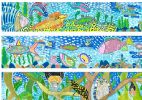
2 Painting scanned and upload into Photoshop. Components of the mural design are edited and arranged into a final composition