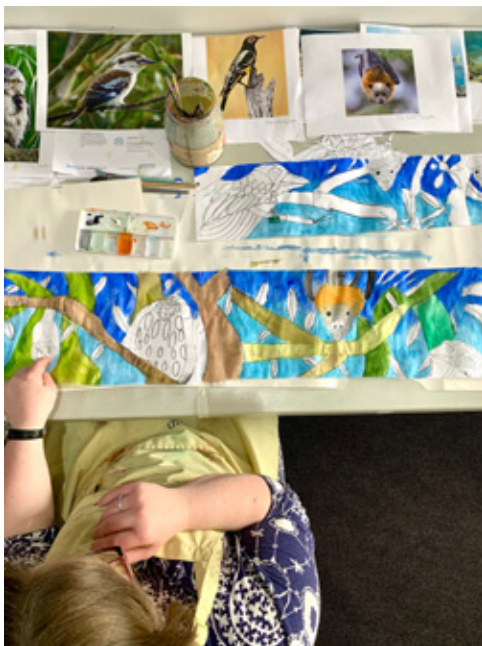
1 Initial sketch and panoramic painting based on local landscape and animal photographs