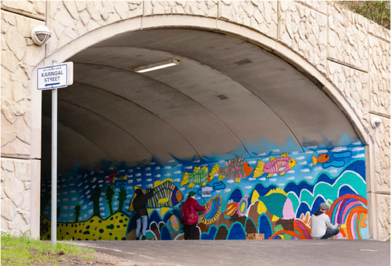
Emily Crockford Oysters Eating Rainbows

OYSTERS EATING RAINBOWS | STAGE 4 WORKSHEET