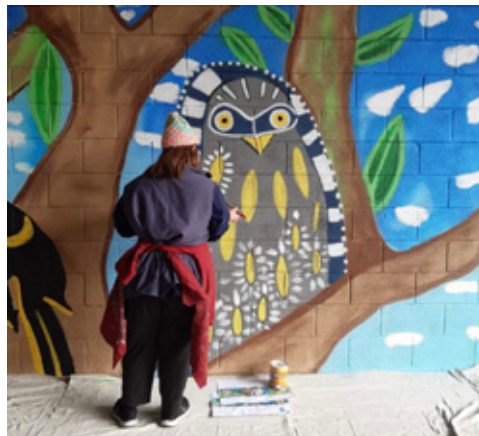
4 Crockford uses a print out of the design as a visual reference as she hand paints part of the mural onto the tunnel surface

Review Crockford's process for creating Oysters Eating Rainbows . Create your own mural design inspired by one of the environments listed below. Refer to the steps used by Emily Crockford and consider including animals, nature, landscapes, patterns, shapes, signs and symbols relevant to your chosen natural environment.