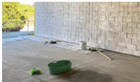
3 Tunnel wall is cleaned with an undercoat applied to the surface where the mural will be painted