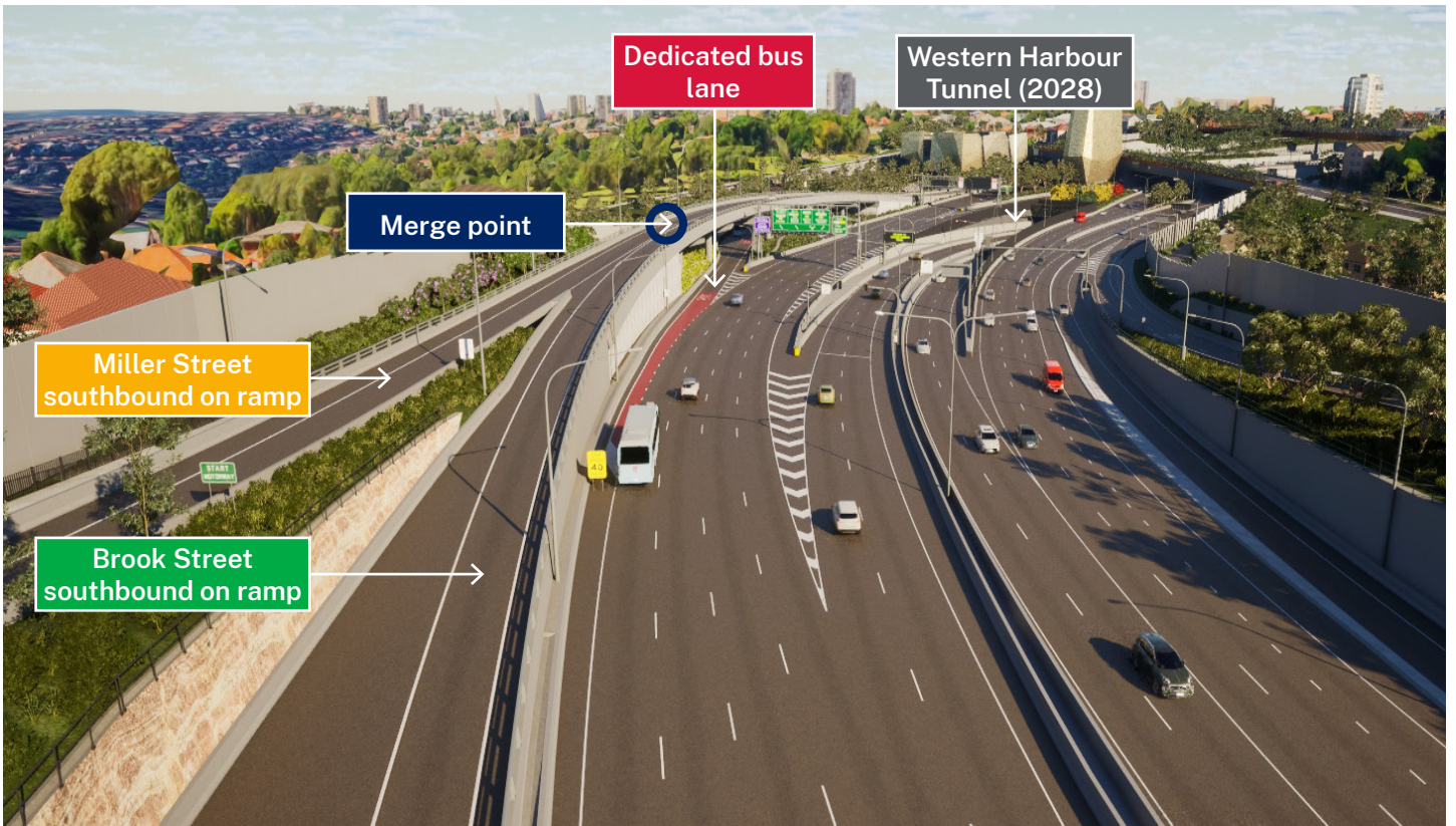
Image: Artist impression of Brook Street on ramp merging into the Miller Street southbound on ramp to form one viaduct structure. Some elements are subject to design, this includes elements of Western Harbour Tunnel Place, Design and Landscape Plan.