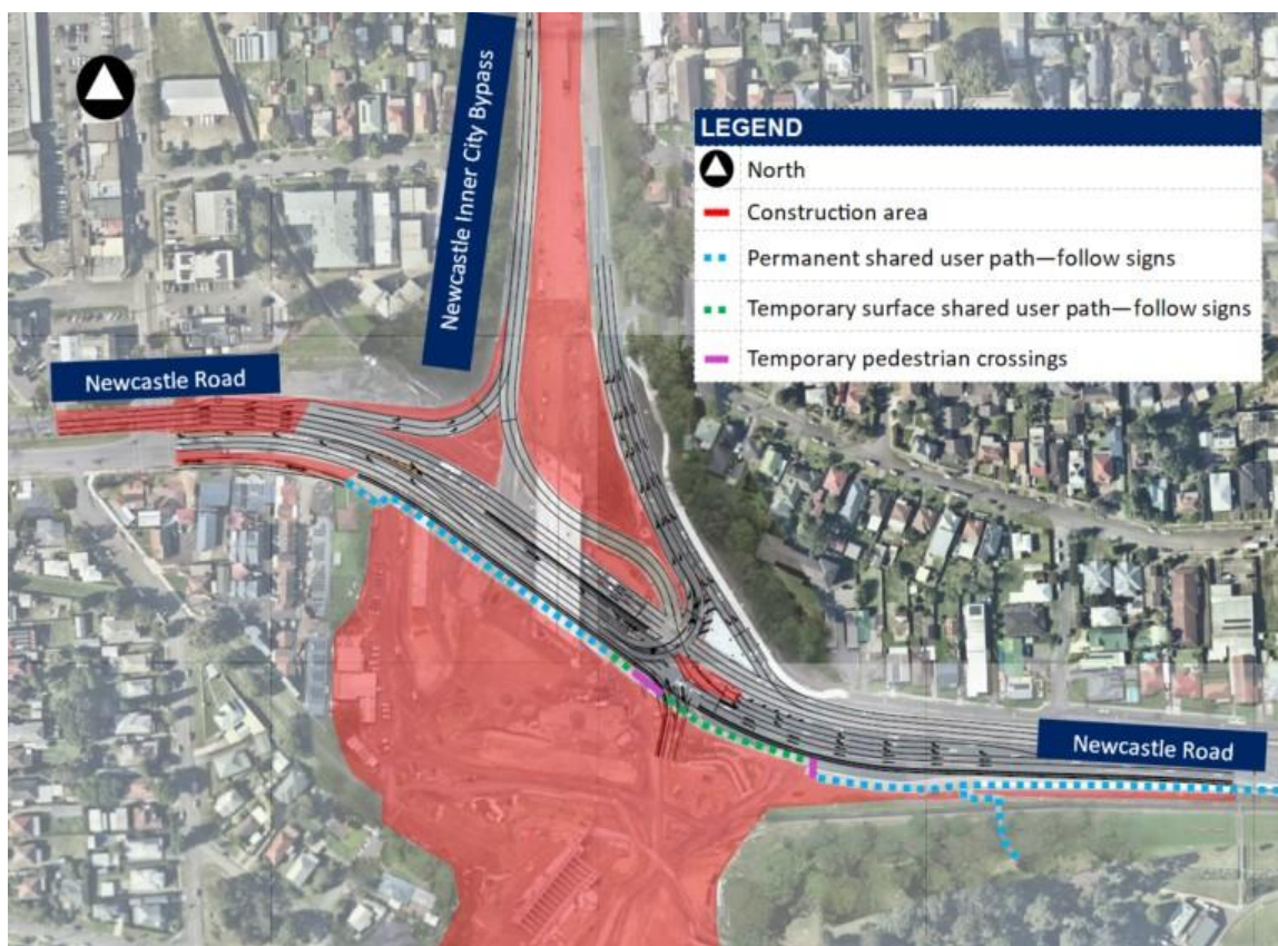
Jesmond - Northern Interchange

This is an artist impression only and is not to scale