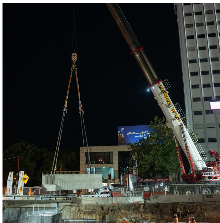
Pictured above: Crane inserting utility pits in the ground at Mount Street and Alfred Street North, North Sydney.

Please refer to the maps over the pages to view our upcoming weekend work and temporary traffic changes.