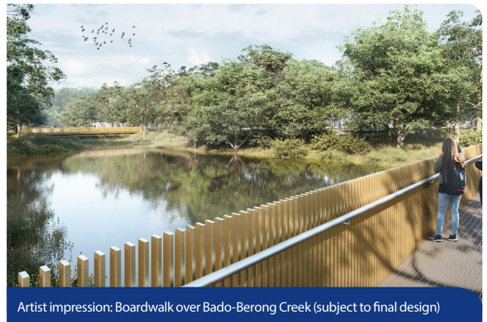
Artist impression: Boardwalk over Bado-Berong Creek (subject to final design)

The community will enjoy many benefits including: