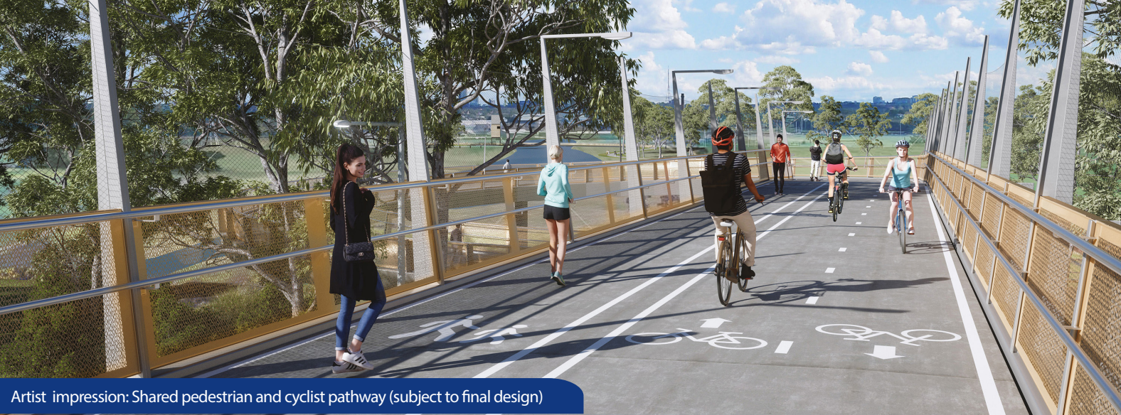
Artist impression: Shared pedestrian and cyclist pathway (subject to final design)