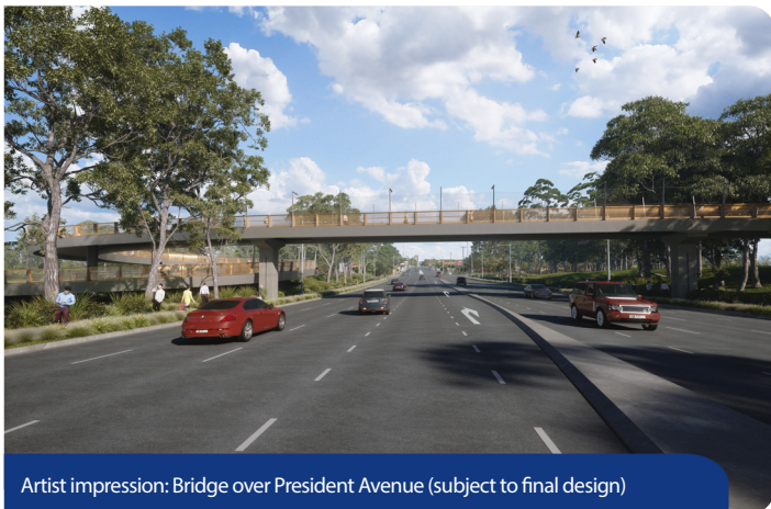
Artist impression: Bridge over President Avenue (subject to final design)

The shared pathway consists of four bridges at Scarborough Park South, President Avenue, Bicentennial Park and Muddy Creek. The design includes eight board walks, concrete paths, lighting, and landscaping to ensure an enjoyable walk any time of the day.