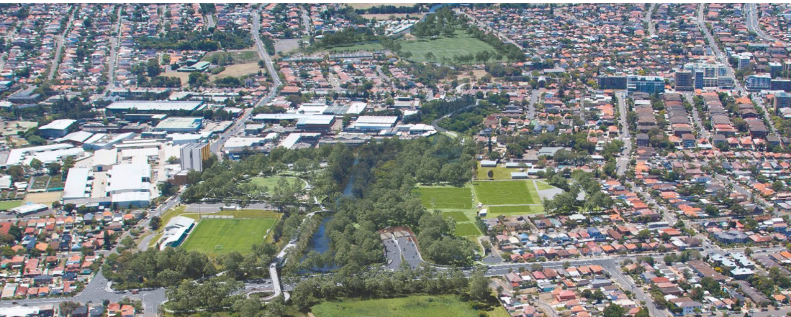
M6 Stage 1 – Artist impression image of Rockdale Bicentennial Park once M6 Stage 1 construction is complete (landscaping shown at maturity).

In the upcoming months, there will be large quantities of spoil removed from tunnelling activities which will increase the number of truck movements from our temporary construction sites. The temporary traffic signals will enable controlled entry and exit for trucks to our sites, making it safer for the community and road users.