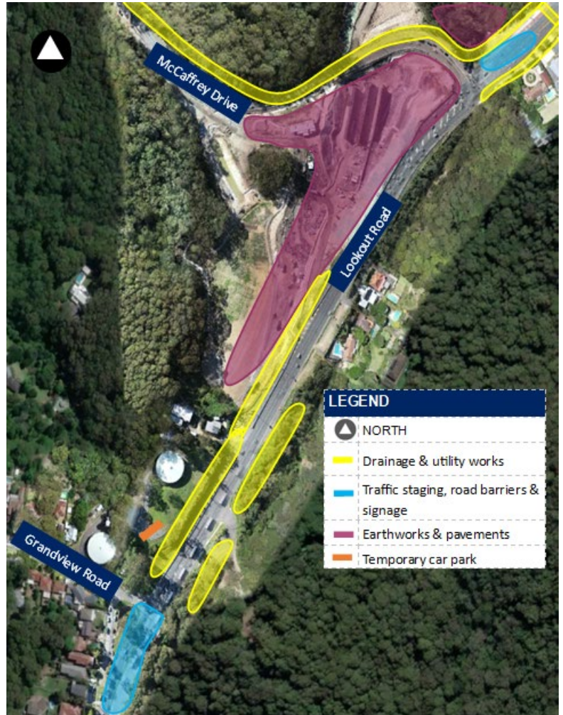
This is an artist impression only and is not to scale.

You can scan the QR code to visit our interactive portal and learn more about the project and register for e-updates.