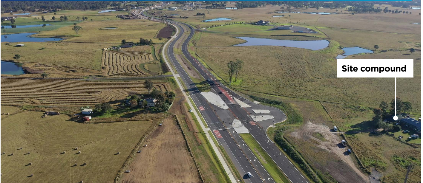
M12 early works site compound 2778 The Northern Road, Luddenham

The Australian and NSW governments are building the M12 Motorway to provide direct access to the Western Sydney International Airport at Badgerys Creek and connection to Sydney’s motorway network.