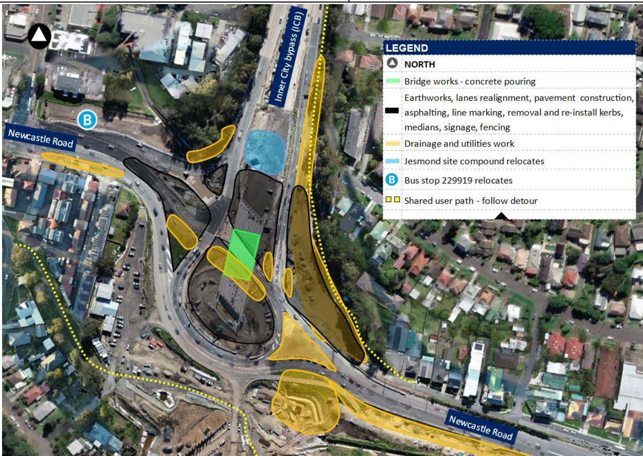
This is an artist impression only and is not to scale.