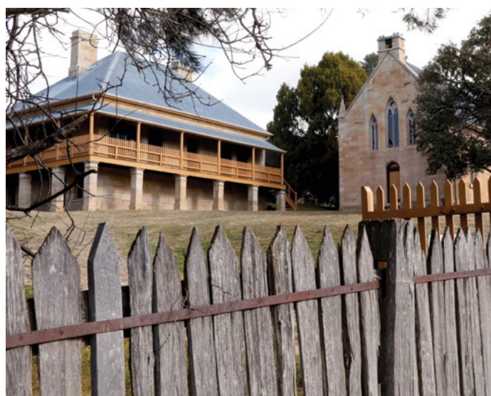
Heritage buildings at Hartley Historic Village

We also held two face-to-face consultation sessions for the wider Aboriginal community in May, where we asked for ideas for cultural interpretation initiatives for the Great Western Highway Upgrade Program. We are exploring all suggestions for potential inclusion into the urban design of the upgrade.