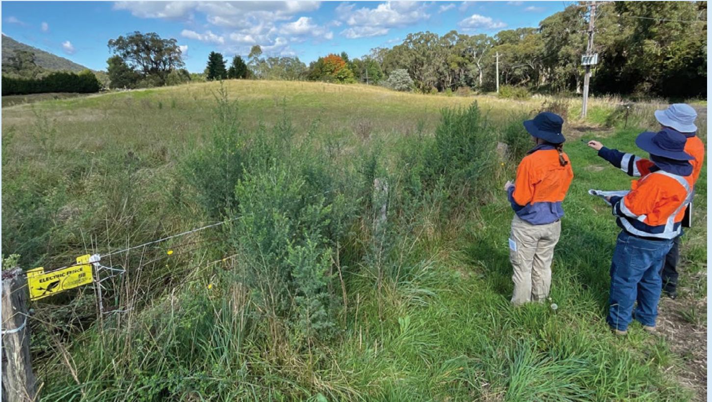
The seed collection team onsite near Coxs River Road

We will hold further meetings with the community as the urban design and cultural interpretation planning progresses.