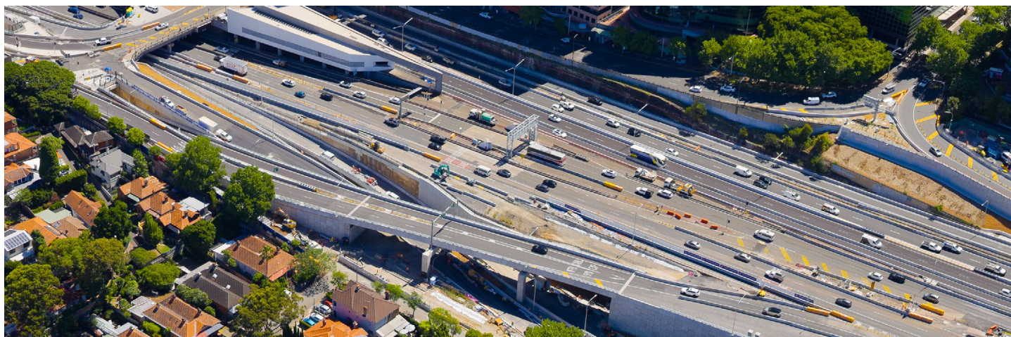
Image: Alfred Street off ramp captured in December 2025.