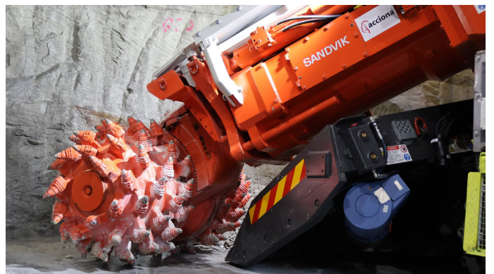
The first roadheader launched from the Ridge Street temporary construction site in May 2024

The roadheader is currently excavating the top of the eight-metre-high tunnel, with a second roadheader being delivered later this year to help speed up the ramp excavation.