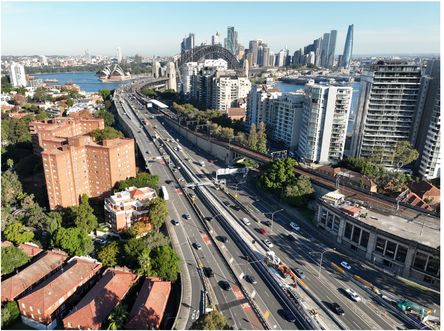
Bird's eye view of Cahill Expressway and Sydney Harbour.