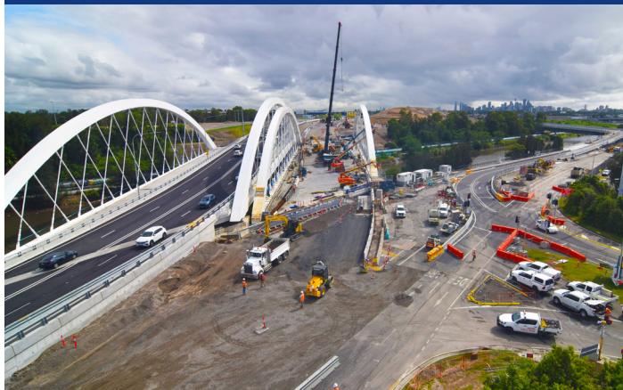
Work continues on the southbound Twin Arch Bridge.