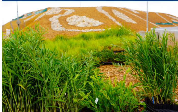
Landscaping and finishing works across the project.