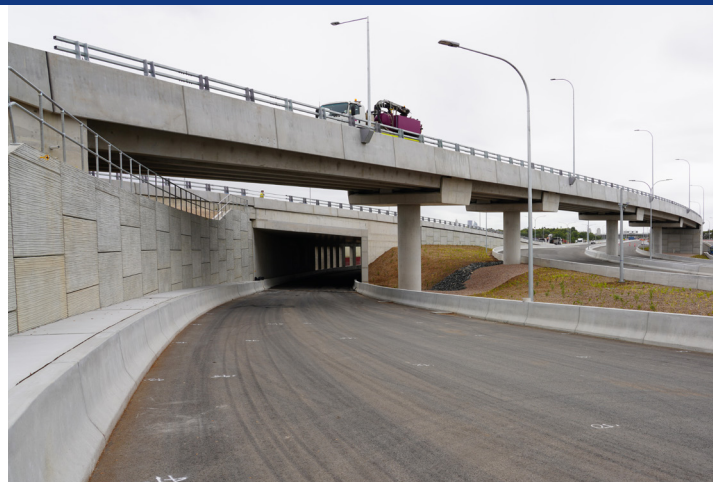
We are laying the final road surface at our St Peters site.