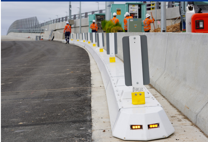
Completing power connections around St Peters.