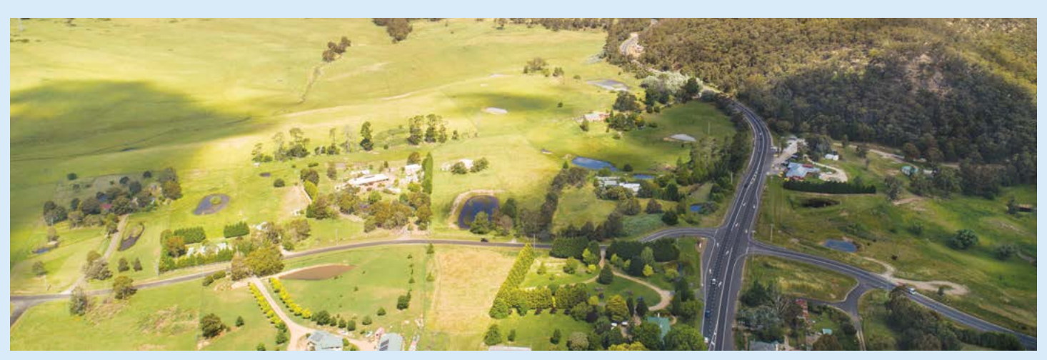
The existing Coxs River Road intersection, looking to the east towards Mount Victoria