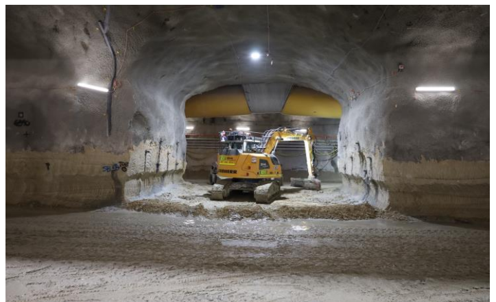
Pictured above: cross passage excavation in Cammeray.