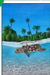
MOLLY, Year 8 (2021) JOURNEY