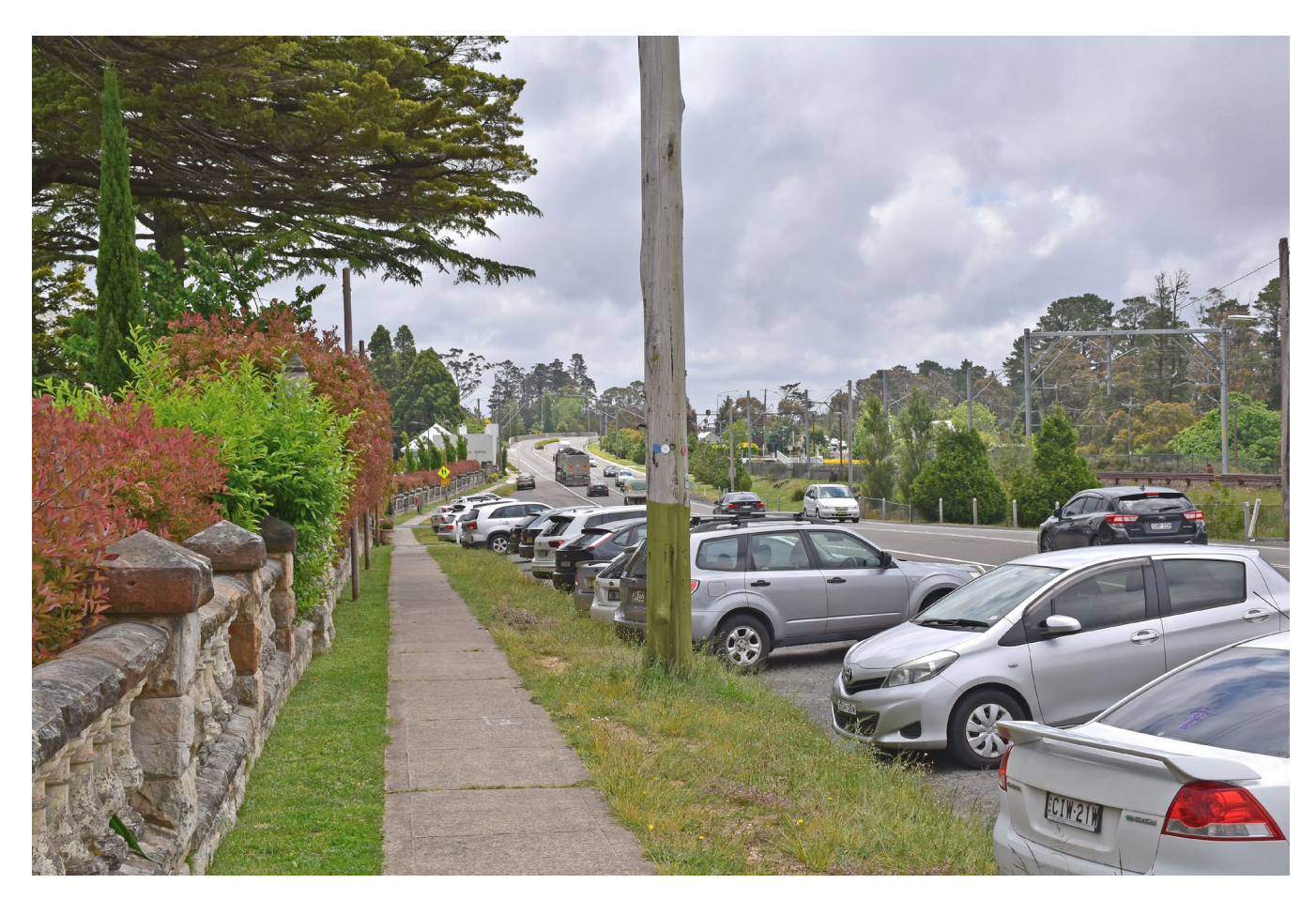
Figure 6-26: Viewpoint 2 (existing): looking north along the existing highway shared user path towards the pedestrian bridge