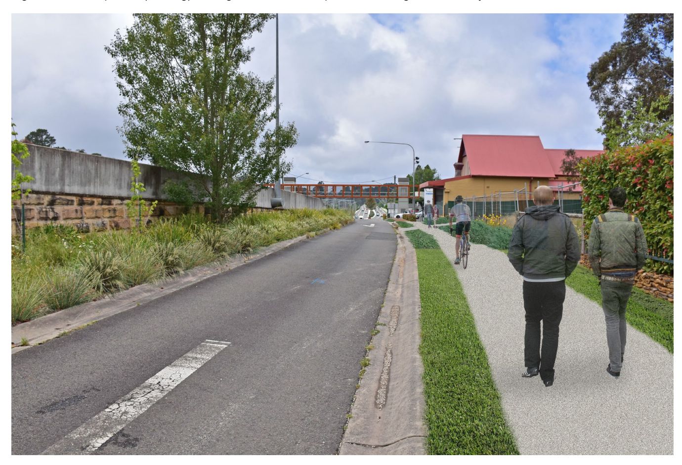
Figure 6-31: Viewpoint 4 (visualisation of proposal) looking north toward the pedestrian bridge and Railway Parade