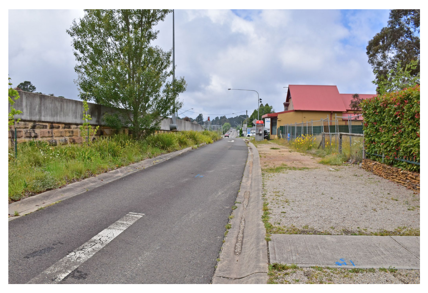
Figure 6-30: Viewpoint 4 (existing) looking north toward the pedestrian bridge and Railway Parade