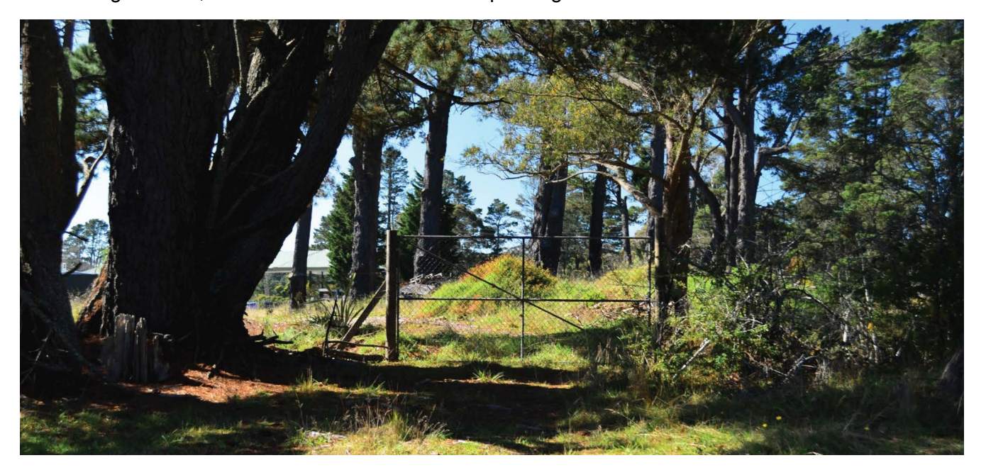
Figure 6-37: Viewpoint 7 (existing) from Bellevue Crescent looking east toward the option road realignment of Bellevue Crescent

The existing views of the location of the alternative Bellevue Crescent is as per Figure 6-37. As can be seen in Figure 6-36, there would be additional tree plantings in this area.