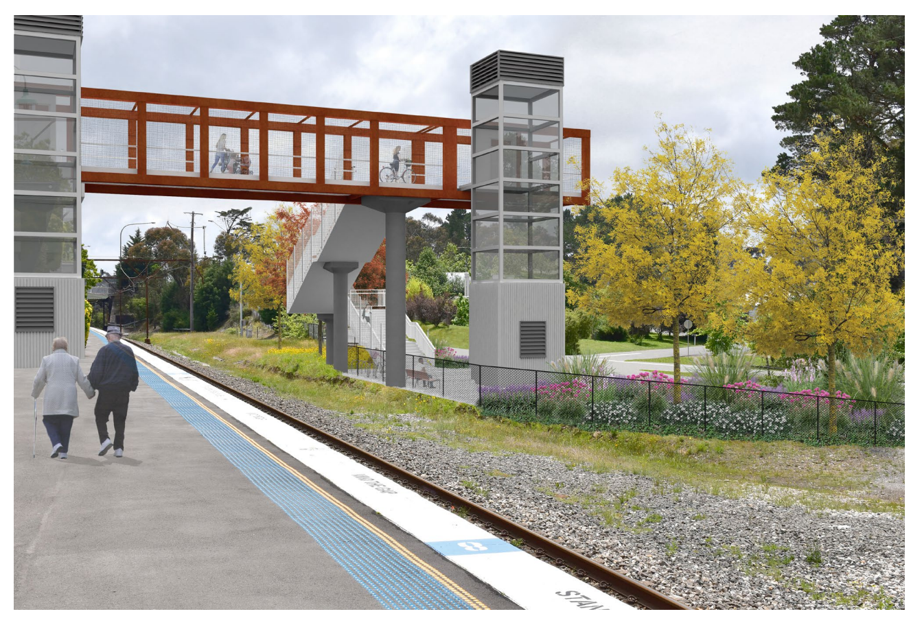
Figure 6-33: Viewpoint 5 (visualisation of proposal) looking north from the Medlow Bath Station platform toward the pedestrian bridge and Railway Parade