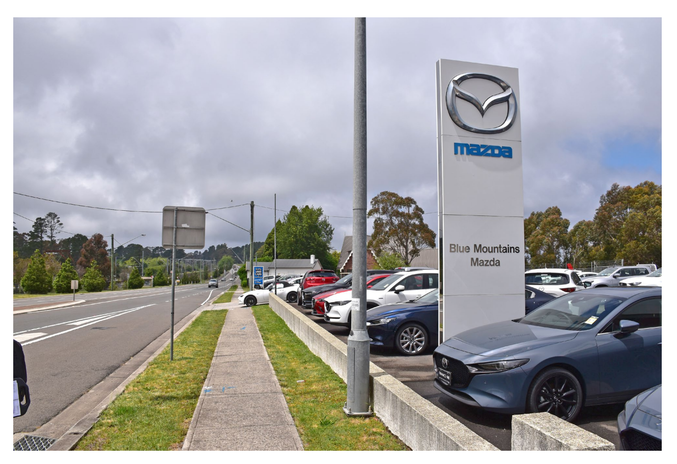
Figure 6-28: Viewpoint 3 (existing): looking south along the existing shared user path toward the proposed pedestrian bridge from adjacent to the Blue Mountains Mazda