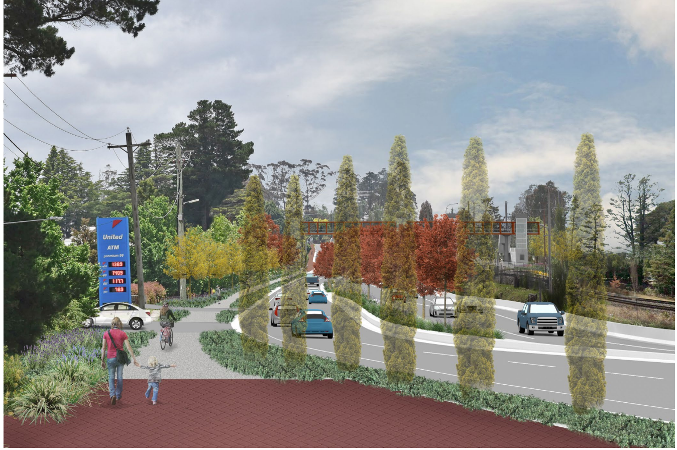
Figure 6-25: Viewpoint 1 (visualisation of proposal): looking north from the western side of the highway at Bellevue Crescent