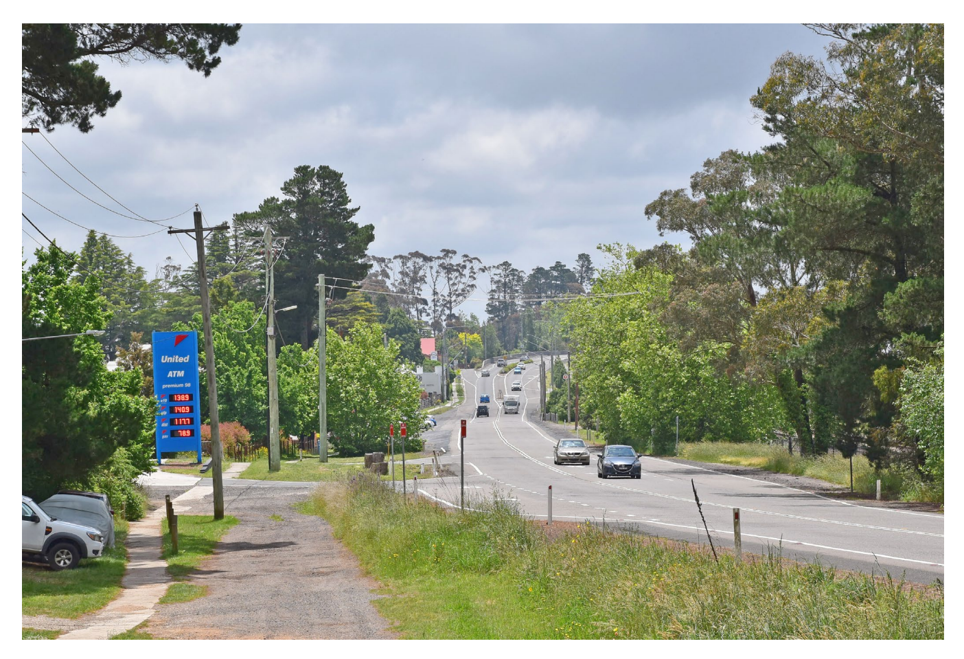
Figure 6-24: Viewpoint 1 (existing): looking north from the western side of the highway at Bellevue Crescent