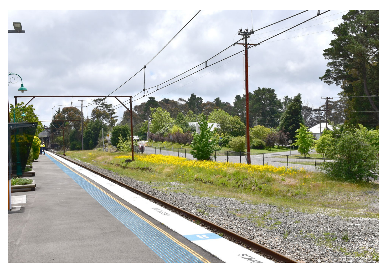
Figure 6-32: Viewpoint 5 (existing) looking north from the Medlow Bath Station platform toward the pedestrian bridge and Railway Parade