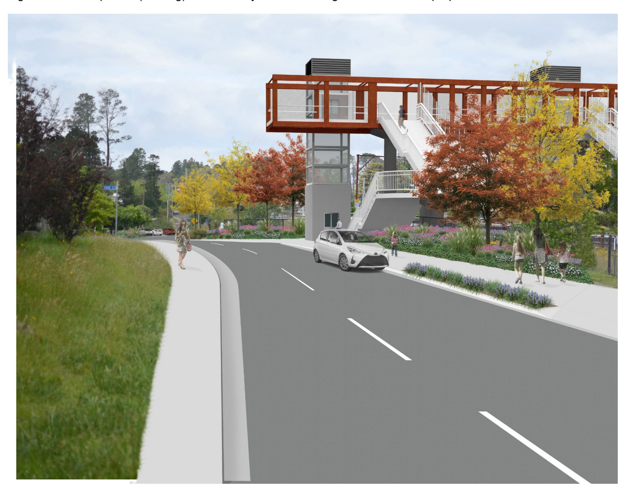
Figure 6-35: Viewpoint 6 (visualisation of proposal) from Railway Parade looking south toward the proposal