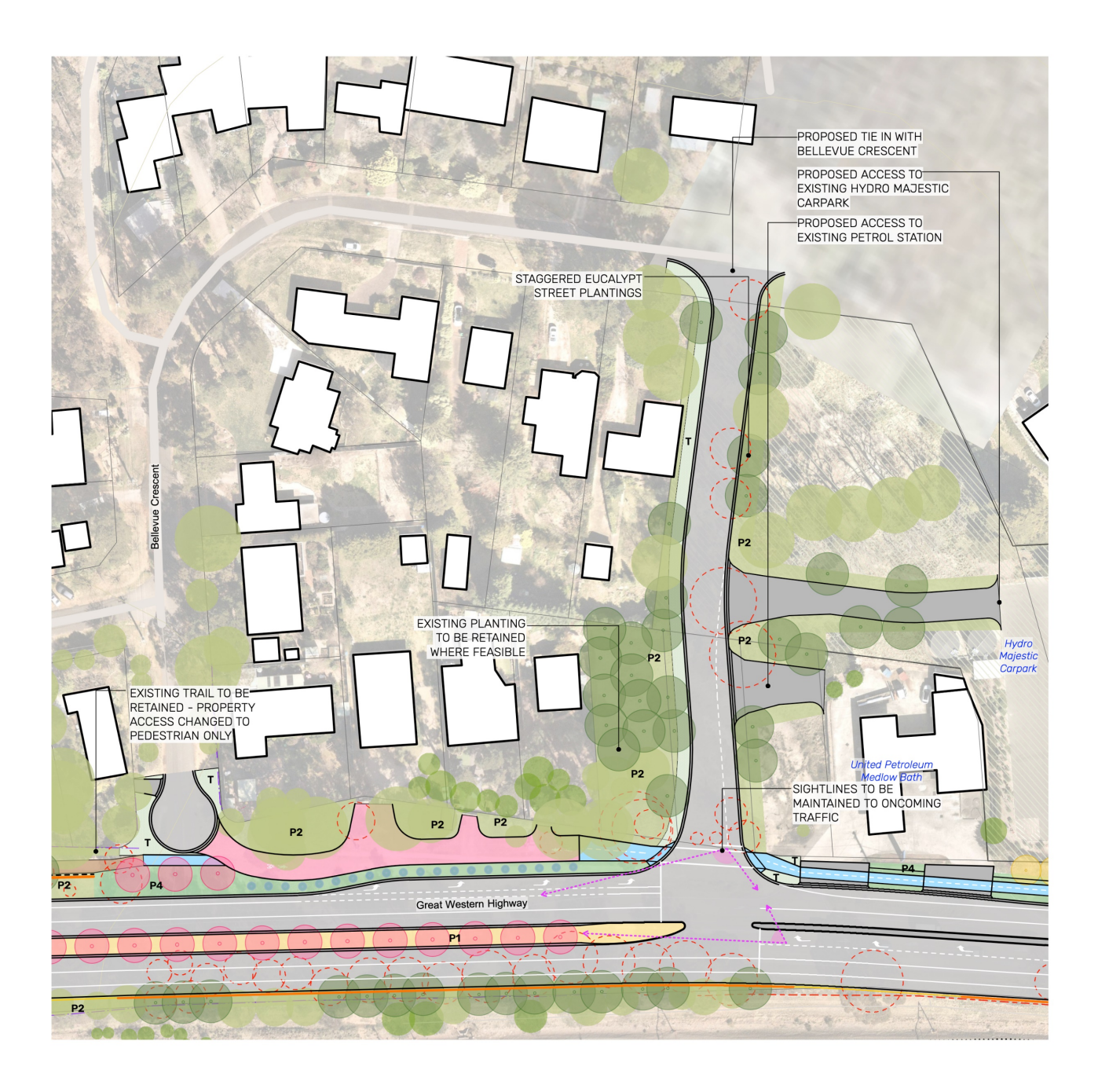
Figure 6-36: Proposed alternative option for Bellevue Crescent (including landscape treatments) (SMM, 2021)

As a result, the proposed turning circle located at 106 Great Western Highway, Medlow Bath would not be required, ultimately reducing the impact on residents, as well as reducing the removal of existing mature trees within this location. The proposed option would also provide a stronger entry gateway into Medlow Bath, through the use of mature trees planted at the entry to the previous entrance into Bellevue Crescent.