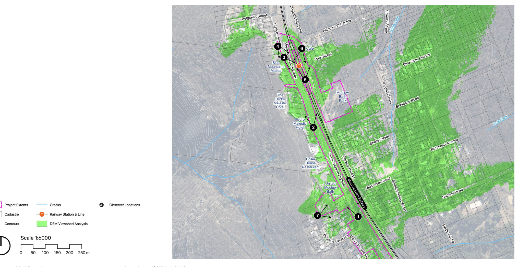
Figure 6-23: Visual impact assessment viewpoint locations (SMM, 2021)