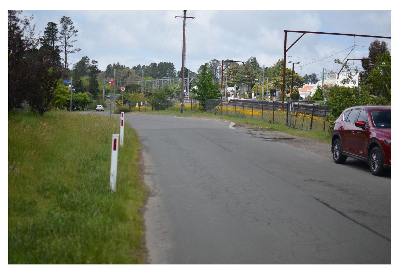
Figure 6-34: Viewpoint 6 (existing) from Railway Parade looking south toward the proposal