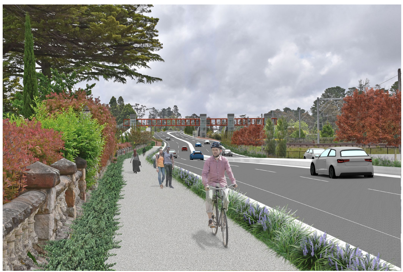
Figure 6-27: Viewpoint 2 (visualisation of proposal): looking north along the existing highway shared user path towards the pedestrian bridge