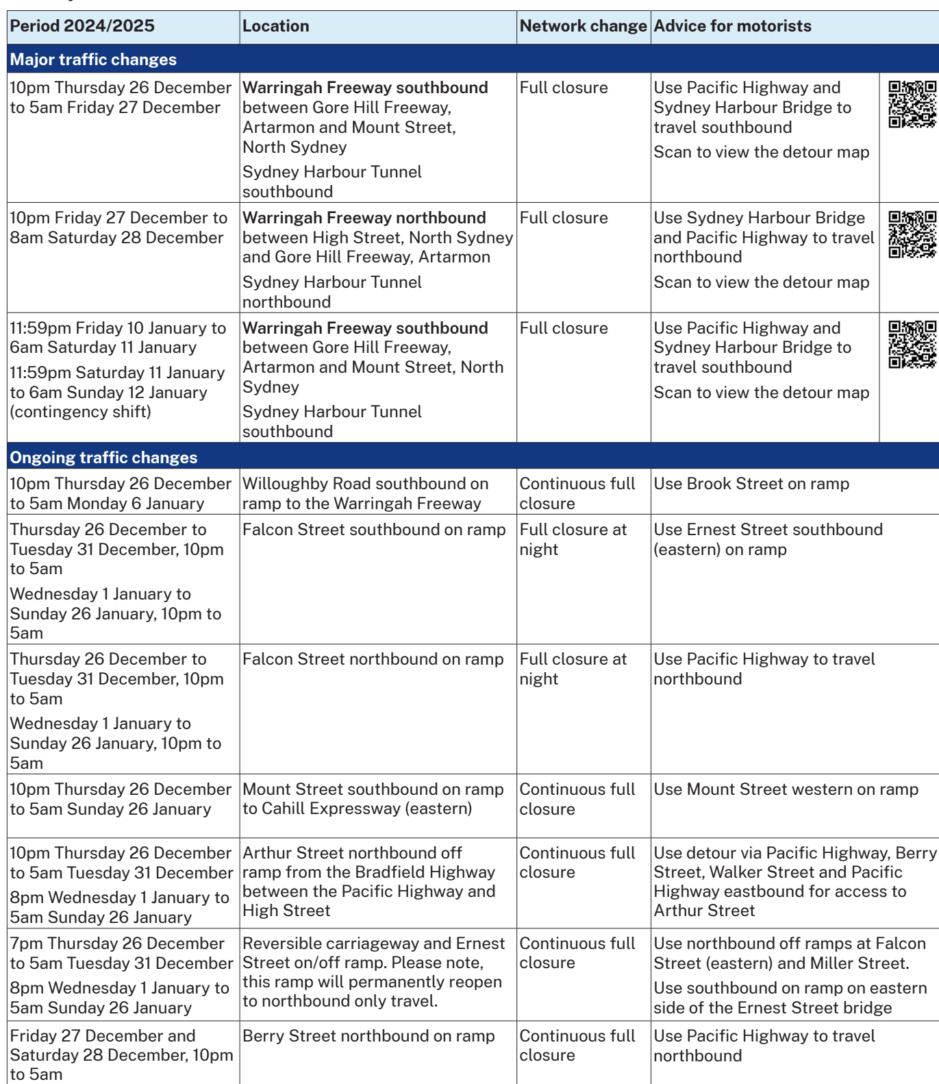
Table 2 – Changed traffic conditions between 10pm Thursday 26 December 2024 and 5am Sunday 26 January 2025*

*The traffic change information in table 2 is correct at the time of printing. We will update the dedicated portal page nswroads.work/wfu-newyearwork , across the holiday period where needed, however, please also visit livetraffic.com or download the app for live traffic updates related to Warringah Freeway Upgrade.