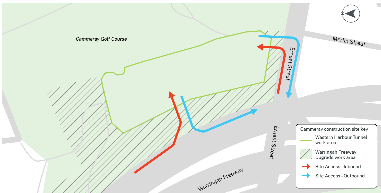
Layout of Cammeray temporary construction site for the Western Harbour Tunnel Stage 2 work.