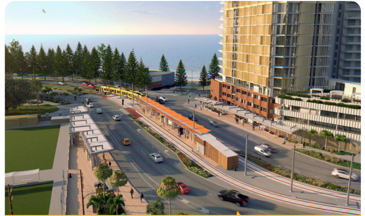
Image: Burleigh Heads station artist impression

Stations are nearly complete but will not open to passengers until services begin in mid-2026. Stage 3 is moving another step closer to delivering smoother, simpler and more connected travel across the Gold Coast.