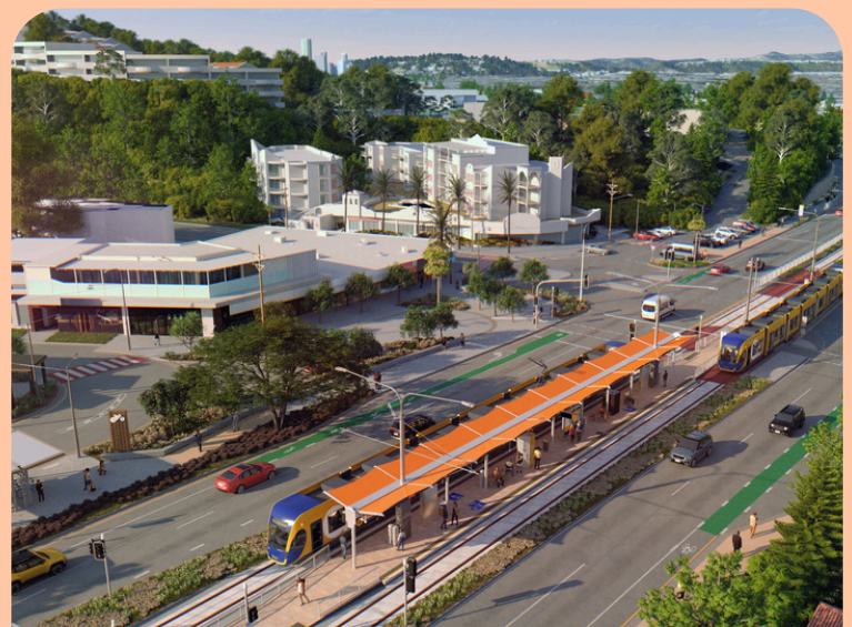
Image: Nobby Beach station artist impression