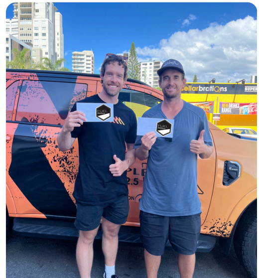
Image: Triple M Gold Coast handing out vouchers following a live cross

We thank members of the local business community for their ongoing patience while we play our part in constructing a more connected Gold Coast, and local residents and visitors for continuing to shop, eat, drink and stay local.