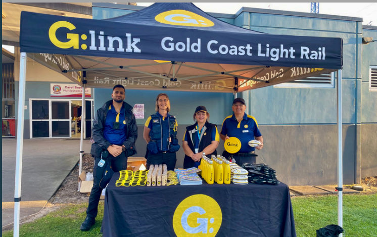
Images: Safety Tram events at local Gold Coast schools

Visit gclr3.com.au/safetytram to explore our safety tram program.