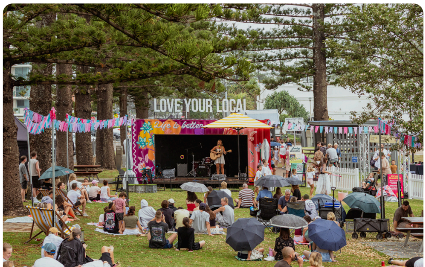
Image: Burleigh Heads Soundbox Session Event