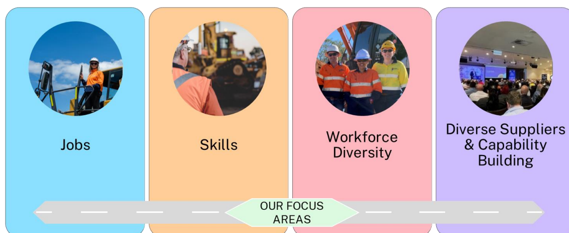
Figure 1: Social Procurement and Workforce Development key focus areas

We create meaningful change for people and communities when delivering our projects.