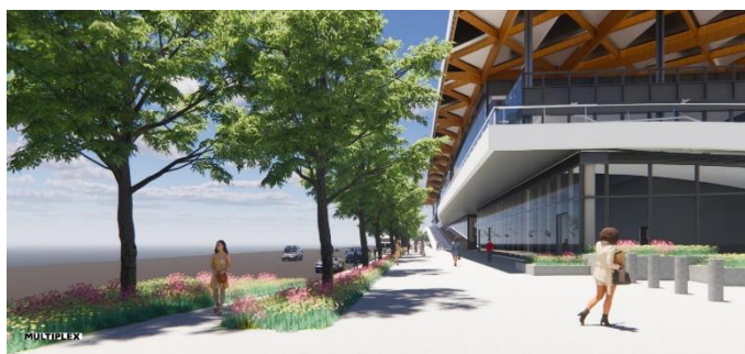
Artists render of upgraded Bridge Road and the new Sydney Fish Market

Traffic management along Bridge Rd will be improved with an extended righthand turn lane into Wattle St, services and utilities will be relocated underground and stormwater drainage will be improved.