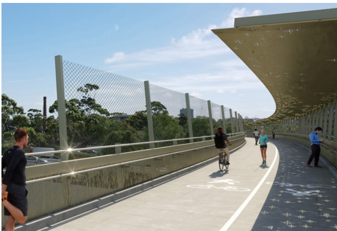
Image 1: Artist's impression of the new Falcon Street Shared User Bridge, view west

Scan the QR code to stay up to date with the latest information about our weekend work and traffic changes.