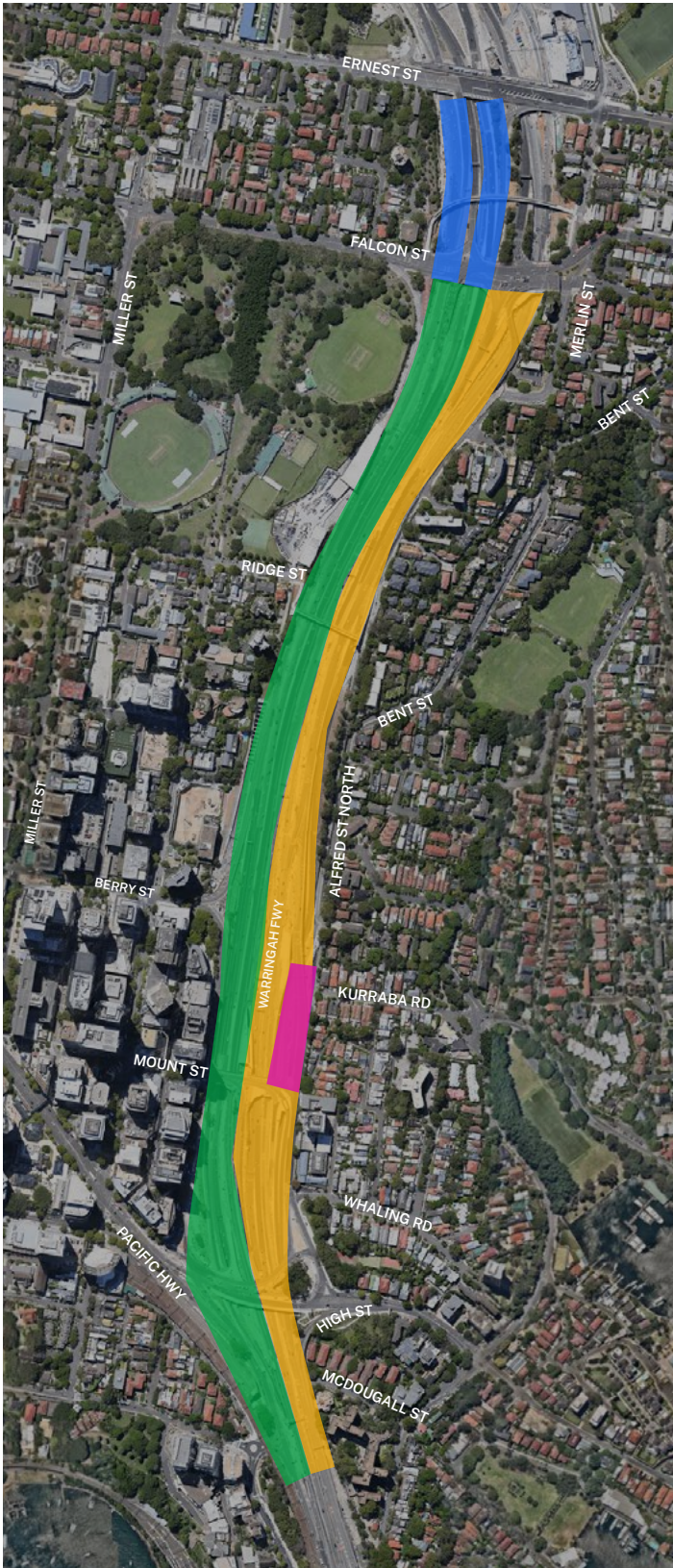
Map 1: Weekend work activity locations from 2 April to 6 April 2026.