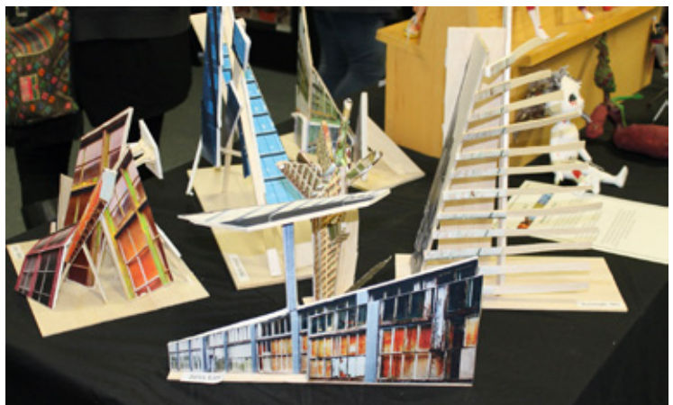
Student work samples based on images taken in Sydney City and Cockatoo Island

As a class, curate and light the finished photographic sculptures as an installation and exhibition. Consider lighting internally and creating spaces within and through the sculpture.