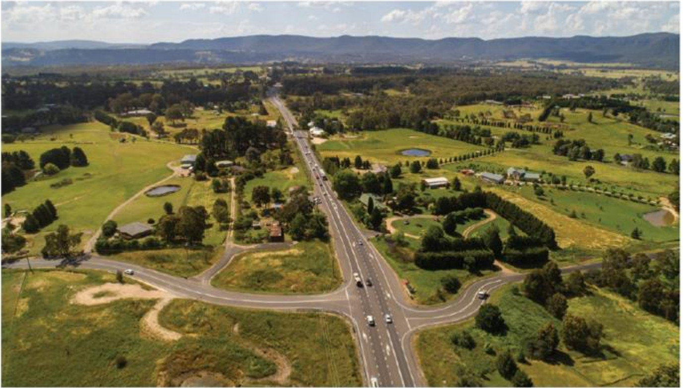
Figure 6-33 View of LCZ 2 at the Coxs River Road facing west