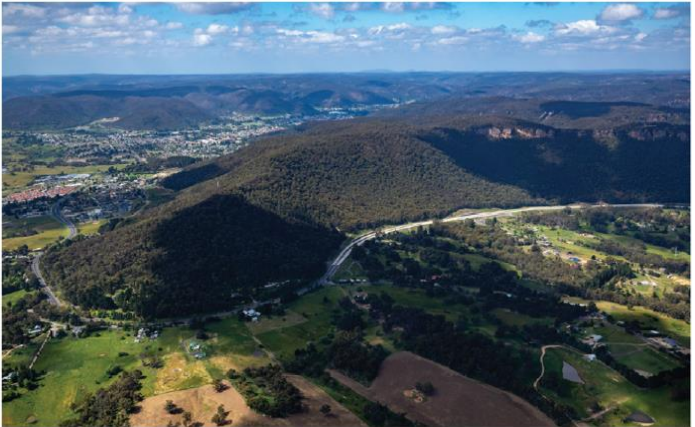
Figure 6-36 View of LCZ 5 looking north east