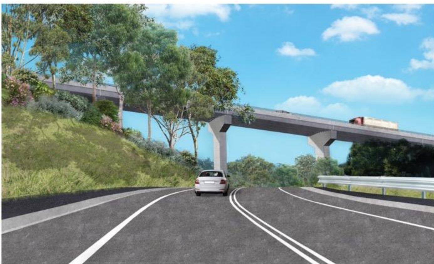
Figure 6-47 Viewpoint 14 (visualisation of proposal) from Jenolan Caves Road, about 230 metres from the Great Western Highway, looking north-east.