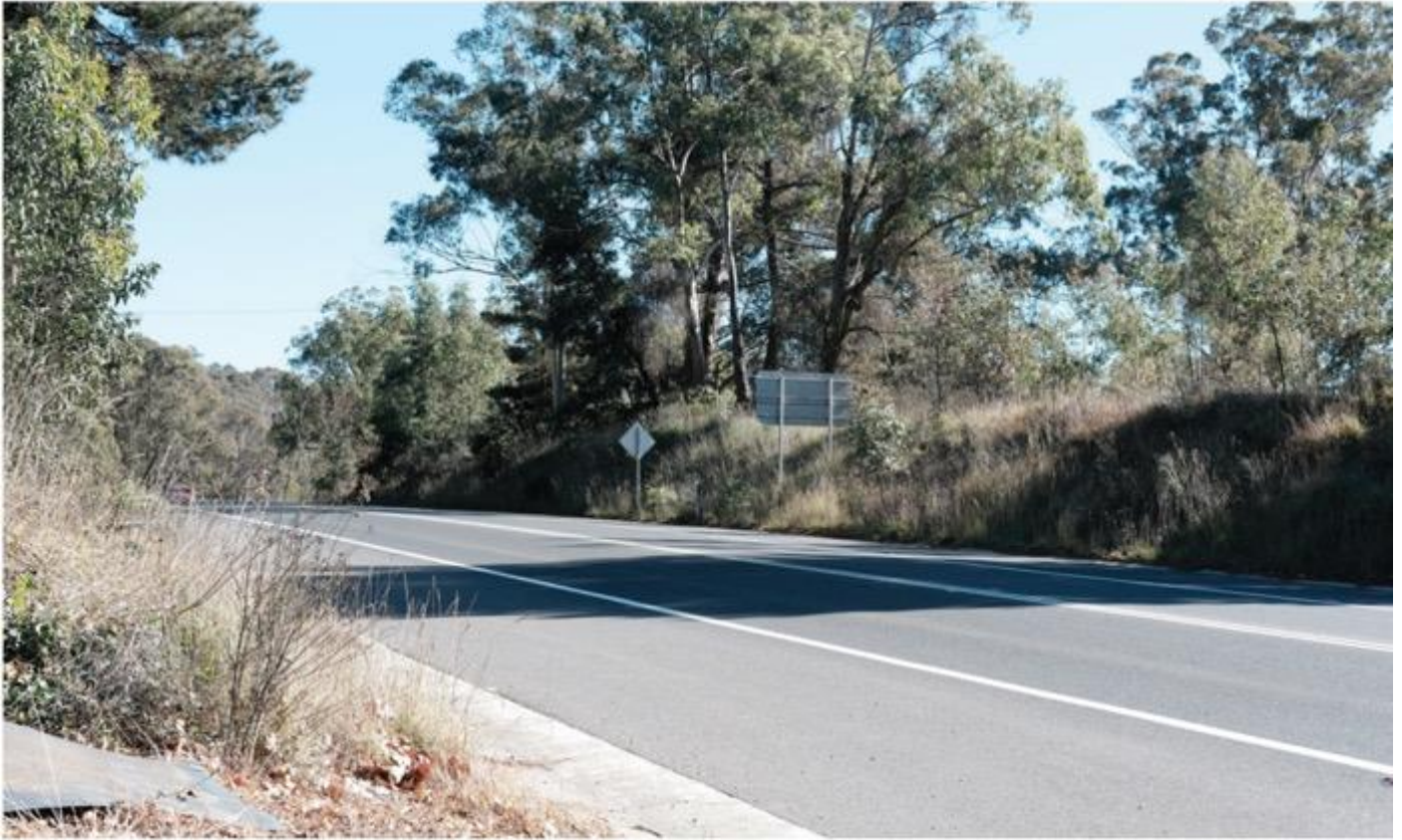
Figure 6-38 Viewpoint 3 (existing) from Great Western Highway at the entrance of Hartley Valley Holiday Farm, looking north-west.