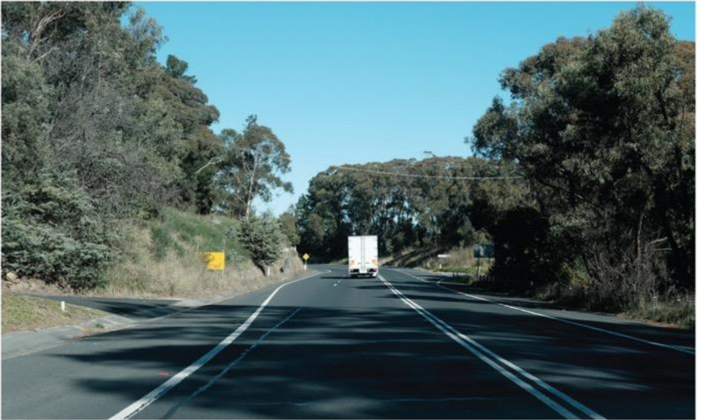
Figure 6-52 Viewpoint 25 (existing) from Great Western Highway, near the intersection of Old Bathurst Road, looking south.