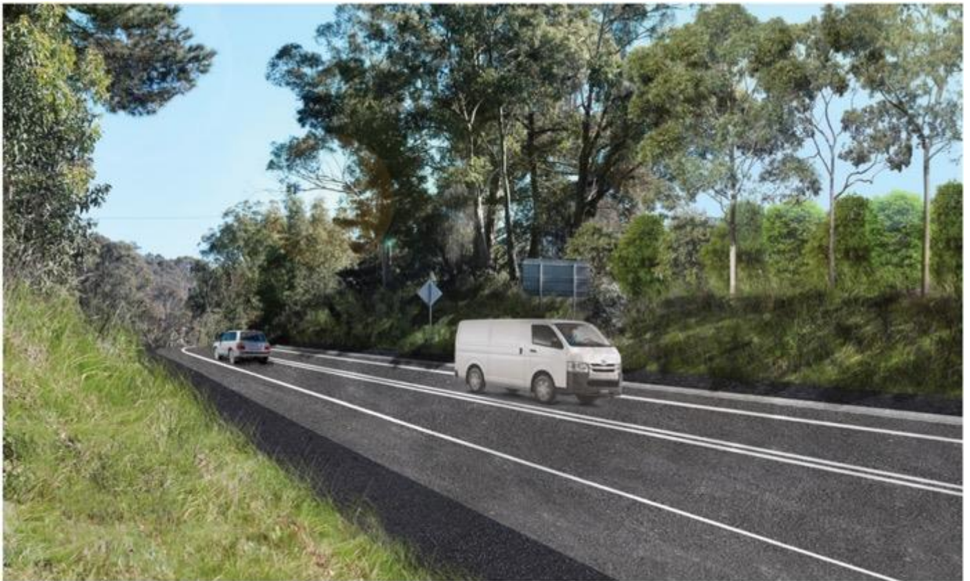
Figure 6-39 Viewpoint 3 (visualisation of proposal) from Great Western Highway at the entrance of Hartley Valley Holiday Farm, looking north-west.