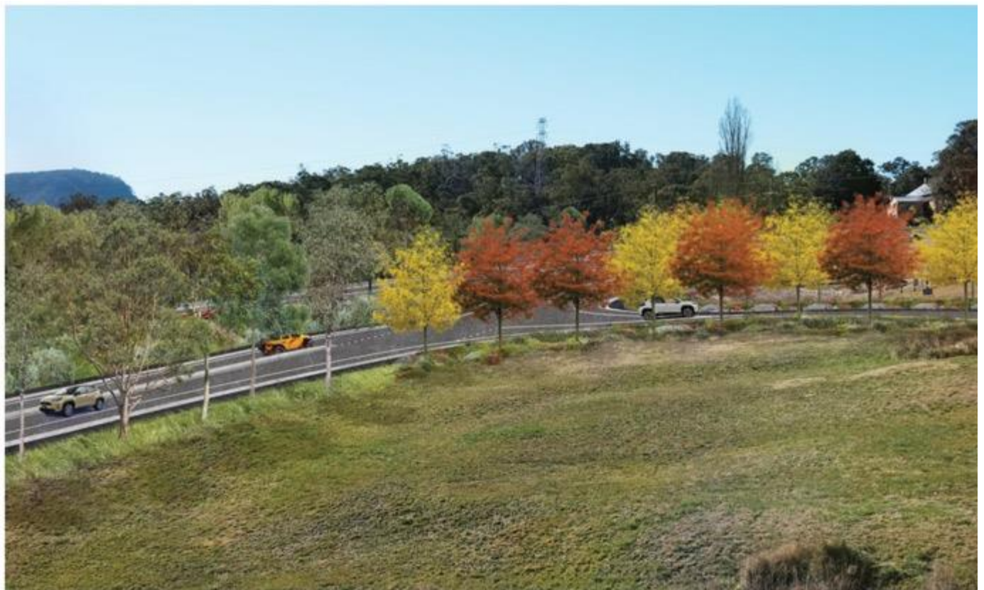
Figure 6-43 Viewpoint 11 (visualisation of proposal) from Old Bathurst Road, Hartley Historic Village, adjacent to the Hartley Courthouse Building, looking north-east.