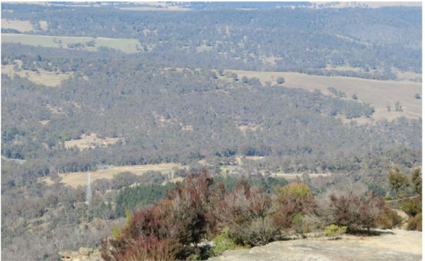
Figure 6-35 View over the eastern slopes of LCZ 4