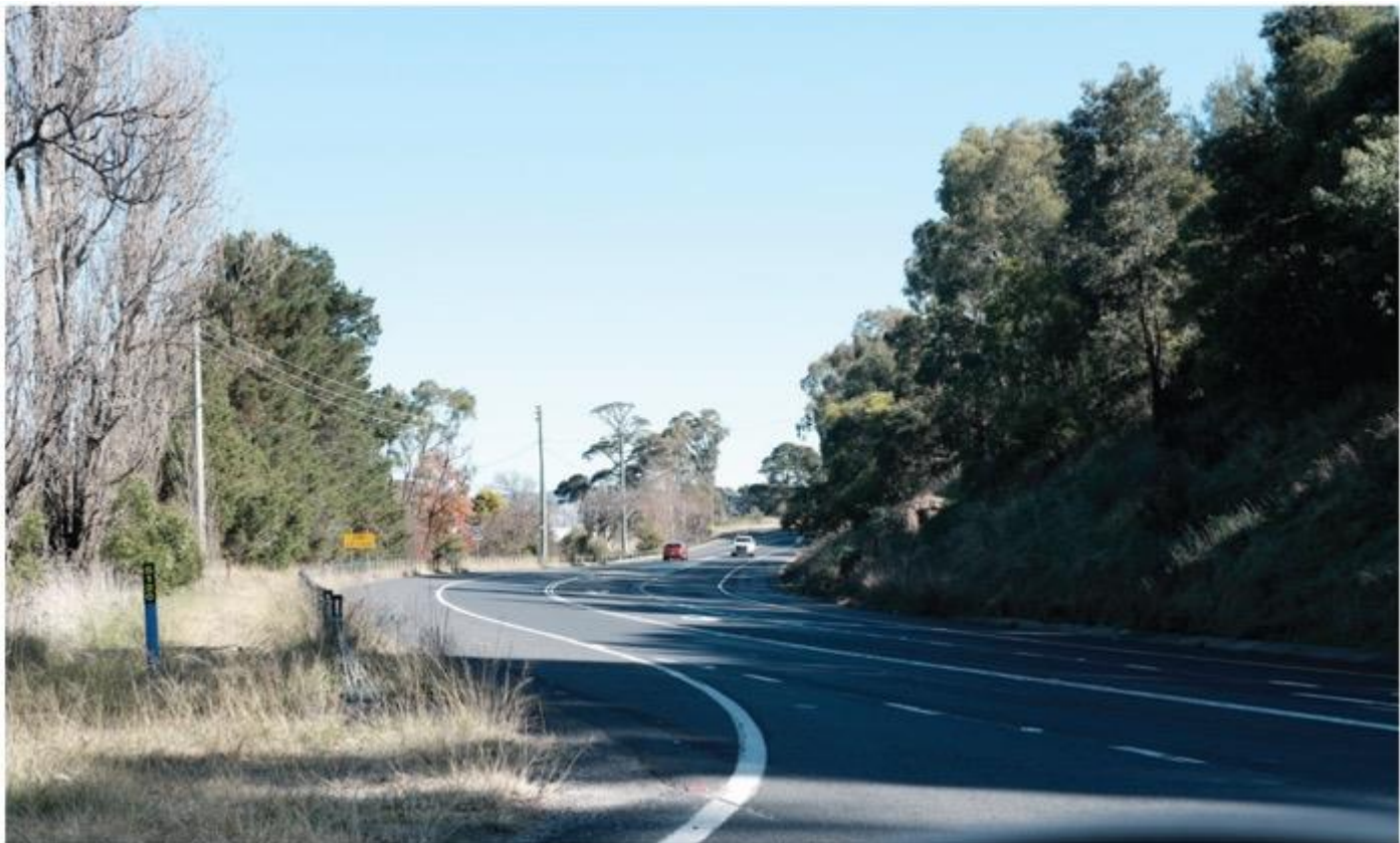
Figure 6-50 Viewpoint 22 (existing) from McKanes Falls Road at intersection with the Great Western Highway, looking west.