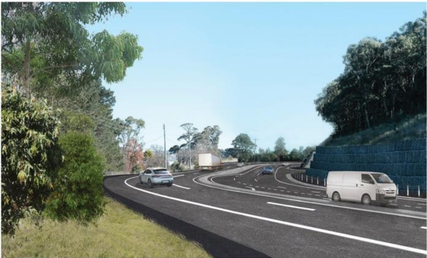
Figure 6-51 Viewpoint 22 (visualisation of proposal) from McKanes Falls Road at intersection with the Great Western Highway, looking west.