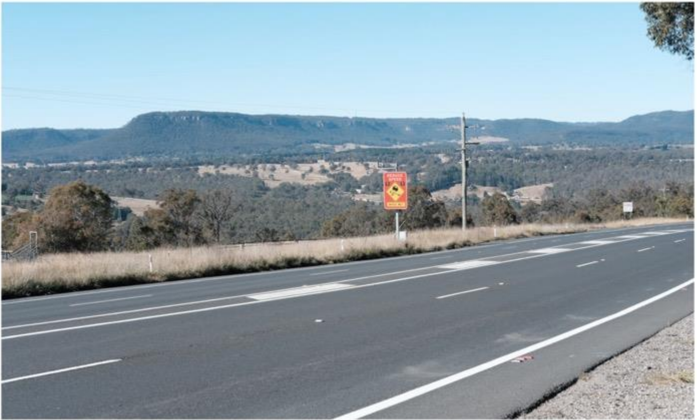
Figure 6-48 Viewpoint 16 (existing) from Great Western Highway, near the entrance to 2987 Great Western Highway, looking south-east.