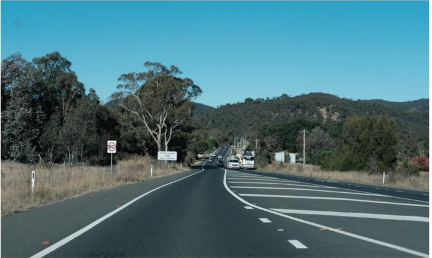
Figure 6-40 Viewpoint 7 (existing) from Great Western Highway, east of Baaners Lane, looking south-east.