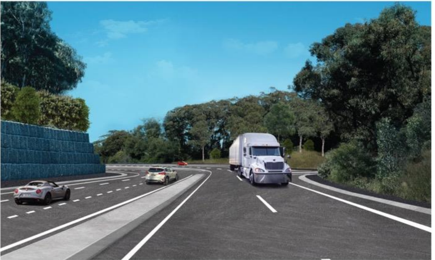
Figure 6-53 Viewpoint 25 (visualisation of proposal) from Great Western Highway, near the intersection of Old Bathurst Road, looking south.