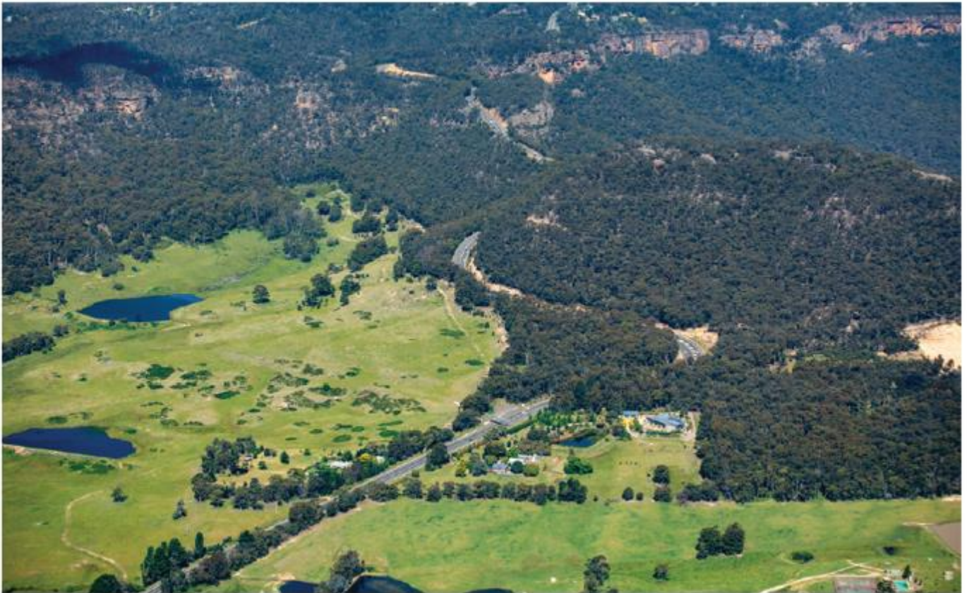
Figure 6-32 View of LCZ 1 facing east towards Victoria Pass

Butlers Creek is an intermittent stream that flows north west into the River Lett. A series of large farm dams provide water for livestock and contribute to the attractive visual character of the area. Additionally this precinct provides views east towards the Mount York ridgeline, Mitchells Ridge and a distant view north-west to Hassans Walls.