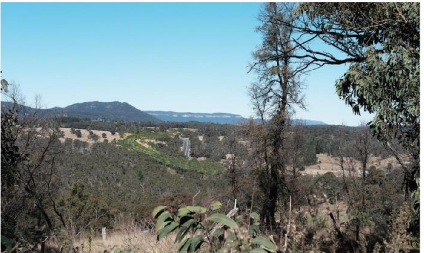
Figure 6-45 Viewpoint 13 (visualisation of proposal) from Blackmans Creek Road, about 1.1 kilometres from the Great Western Highway, looking south-east.