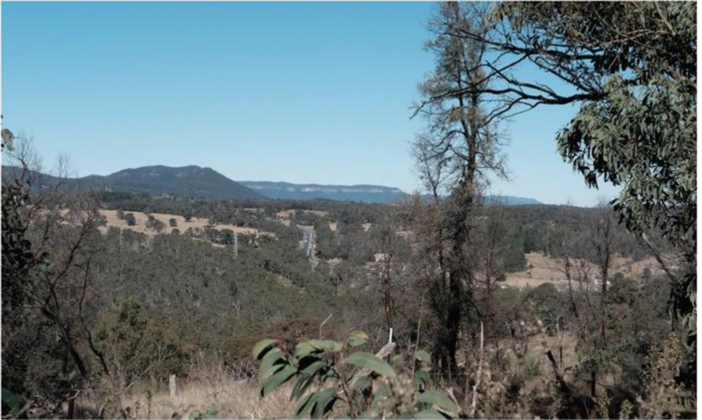
Figure 6-44 Viewpoint 13 (existing) from Blackmans Creek Road, about 1.1 kilometres from the Great Western Highway, looking south-east.