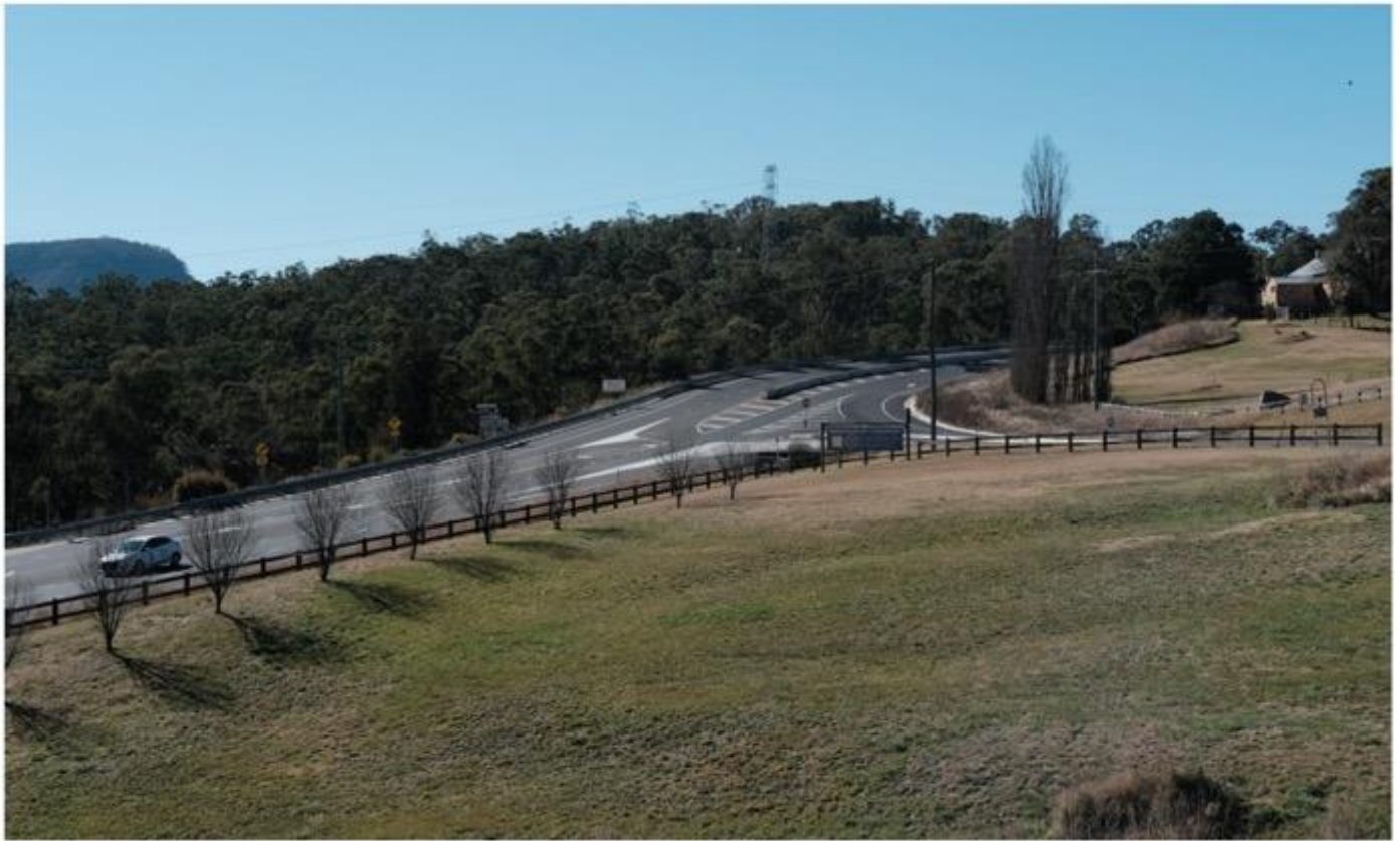
Figure 6-42 Viewpoint 11 (existing) from Old Bathurst Road, Hartley Historic Village, adjacent to the Hartley Courthouse Building, looking north-east.