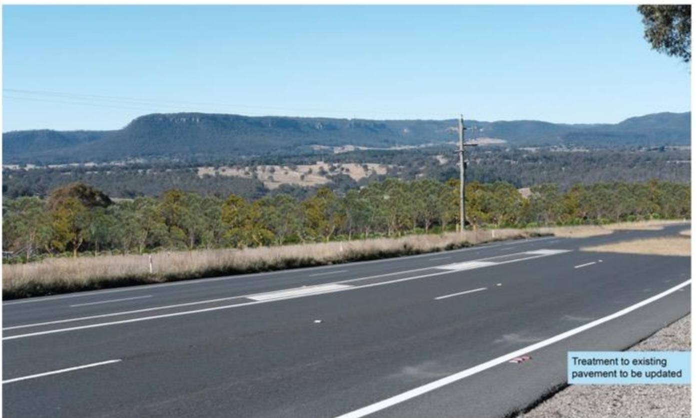
Figure 6-49 Viewpoint 16 (visualisation of proposal) from Great Western Highway, near the entrance to 2987 Great Western Highway, looking south-east.