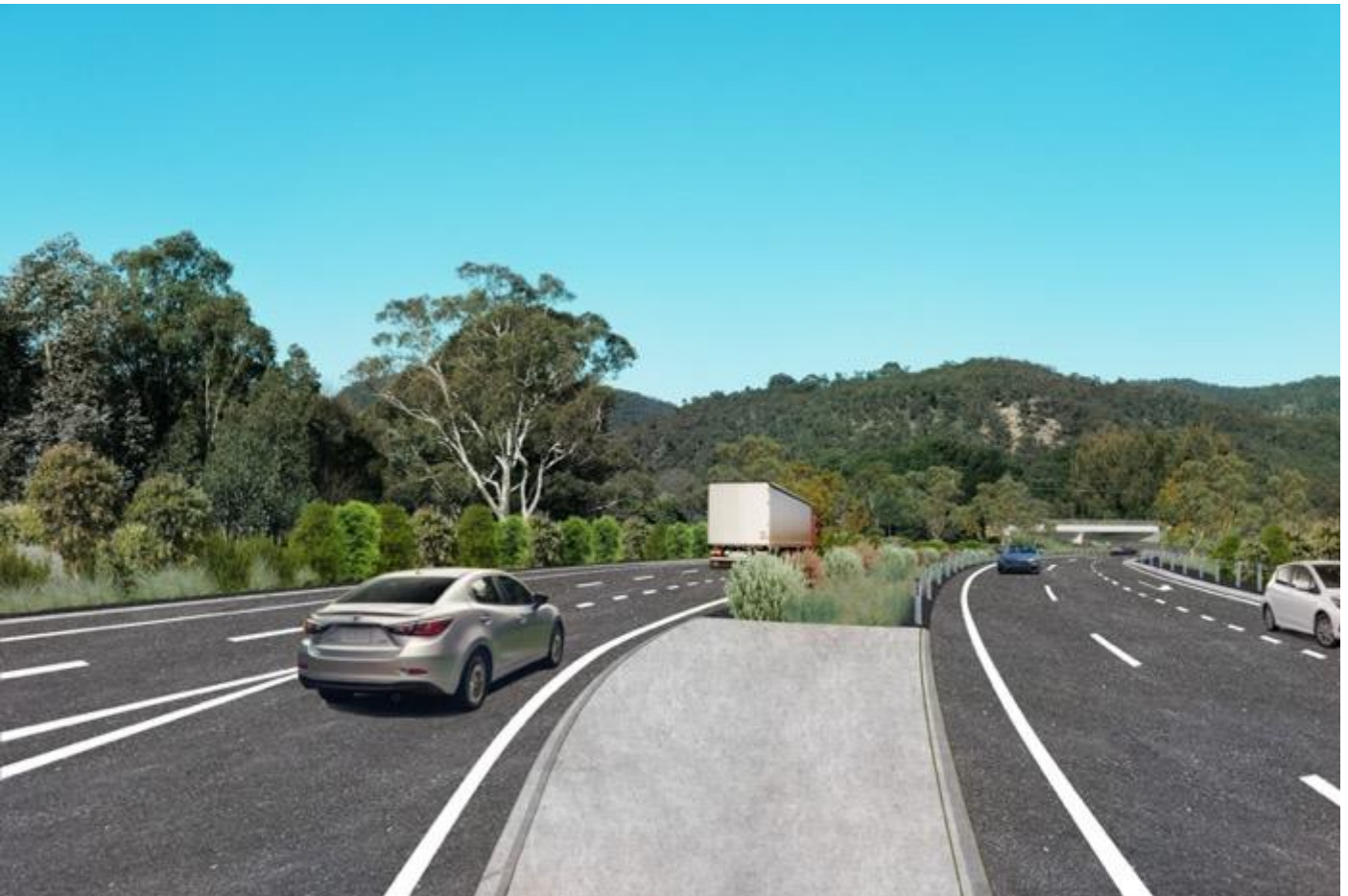
Figure 6-41 Viewpoint 7 (visualisation of proposal) from Great Western Highway, east of Baaners Lane, looking south-east.