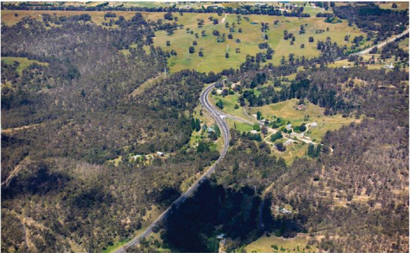
Figure 6-34 View of LCZ 3 at Hartley Historic Village facing east