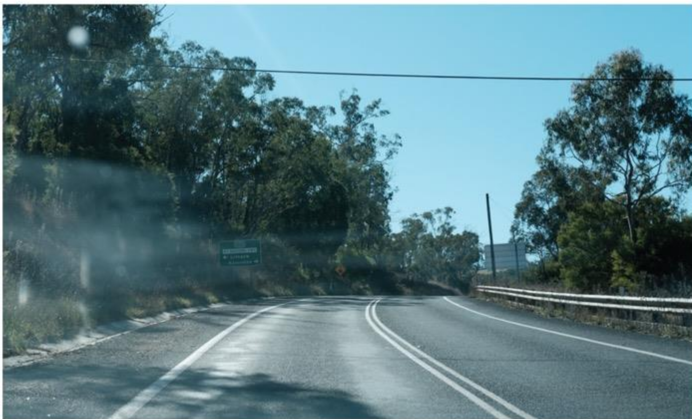
Figure 6-46 Viewpoint 14 (existing) from Jenolan Caves Road, about 230 metres from the Great Western Highway, looking north-east.