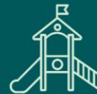
Inclusive play space