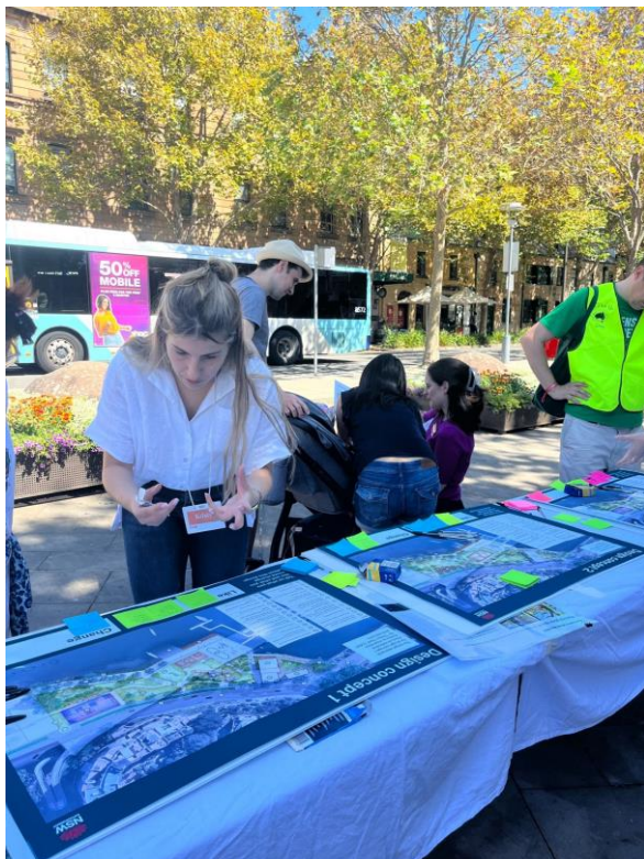
Below: Pop-up at Union Square