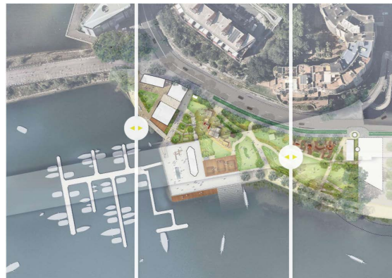
Above: Three-way slider on the website to compare the design concepts.

The following sections provide a brief overview of each of the three different park concepts, and the feedback heard during consultation, including the survey, drop-in sessions, school workshops and submissions.