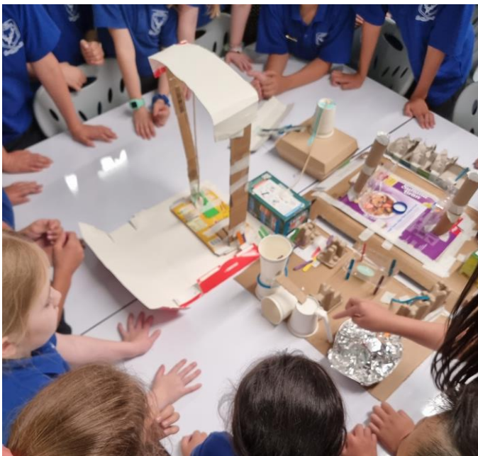
Below: Student engagement at Ultimo Public School

The consultation approach aimed to reach a range of audiences to help inform the future park design. The age of respondents and relationship with the park are included on the right. Demographic data was not collected during the drop-in sessions.