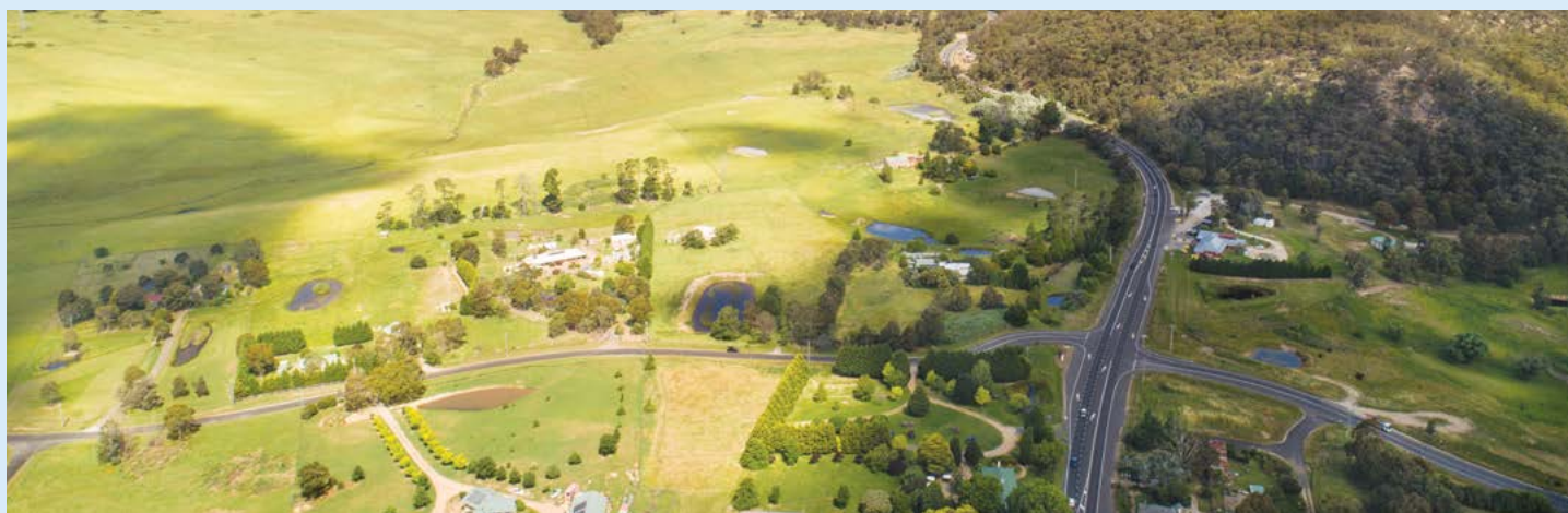
The existing Coxs River Road intersection, looking to the east towards Mount Victoria