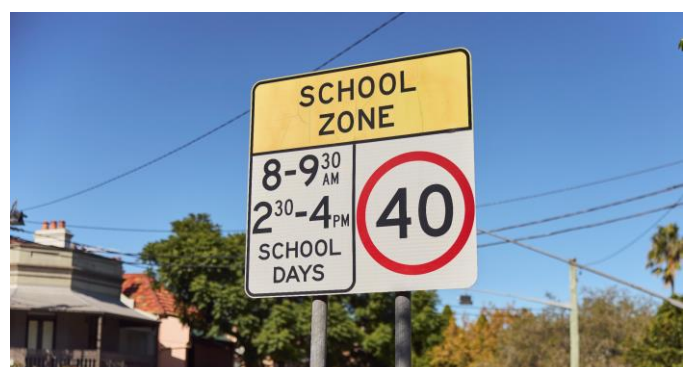
Example of sign to be installed on Campbell Street

Penalties may apply after the signs are installed.