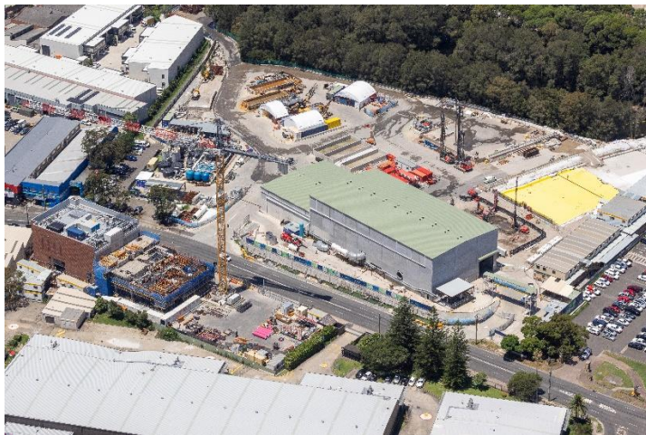
Image 1: Aerial image facing east showing West Botany Street between Bermill Street and French Street, December 2024

M6 Stage 1 tunnelling in the area impacted by subsidence will recommence in 2025. From March 2025 until the end of 2026 West Botany Street, Rockdale will be reduced to one lane each way between French Street and the northern carpark of Bicentennial Park while the ground is improved.