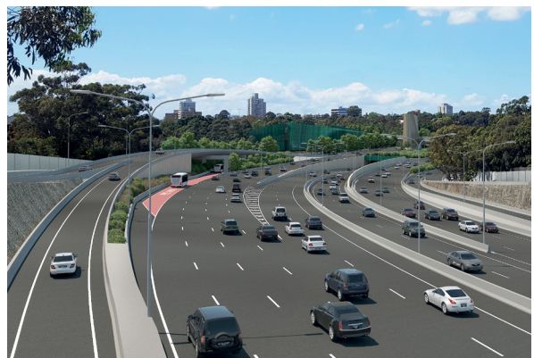
Artist's impression: view from the Miller Street bridge. Subject to change following detailed design

Service and utility relocation and removal work will be starting in March. This work is being carried out by the Sydney Program Alliance on behalf of Transport for NSW. This work will include establishing four temporary site compounds, above and below ground service and utilities relocations and removal including power, water, sewer and telecommunications.