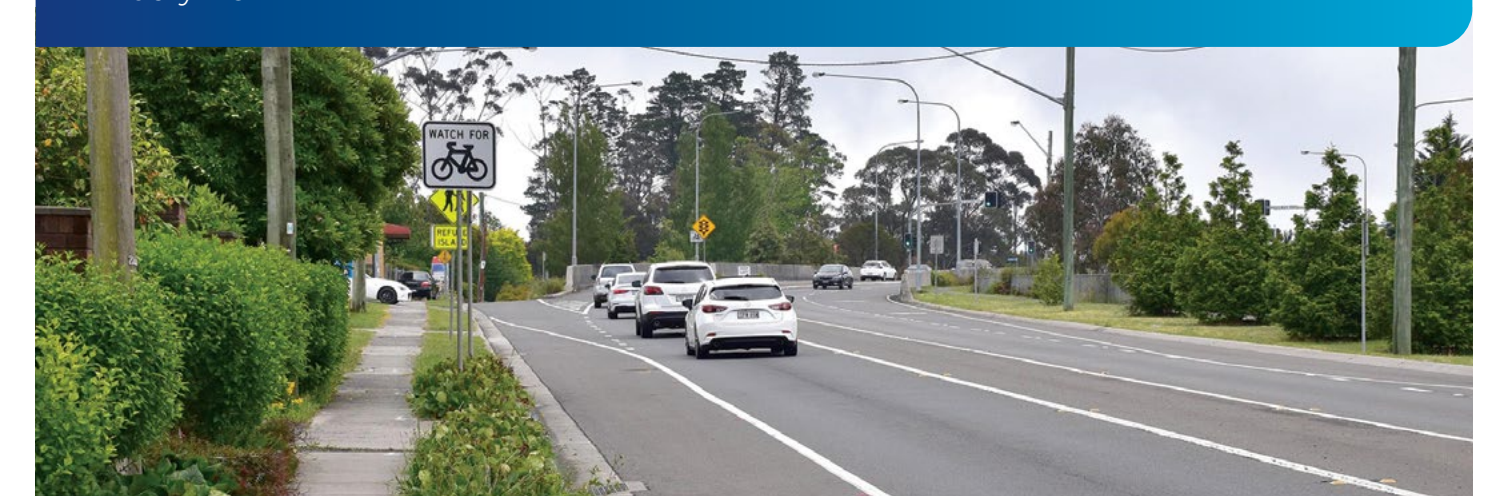
Pedestrians and cyclists will benefit from a new shared pathway in Medlow Bath

Medlow Bath Upgrade Review of Environmental Factors Pedestrians and cyclists fact sheet July 2021