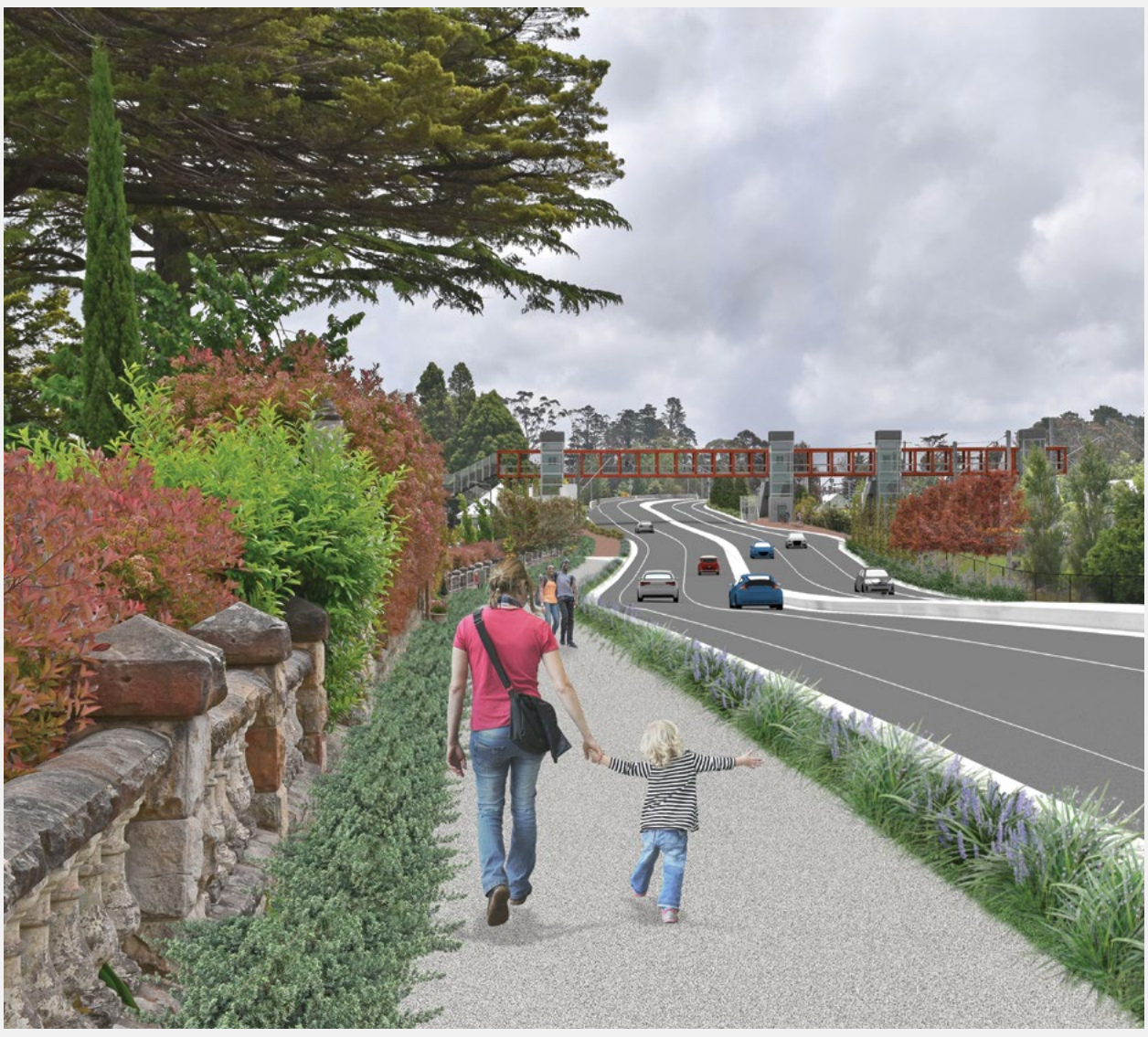
Artist's representation of proposed Medlow Bath Upgrade pedestrian bridge