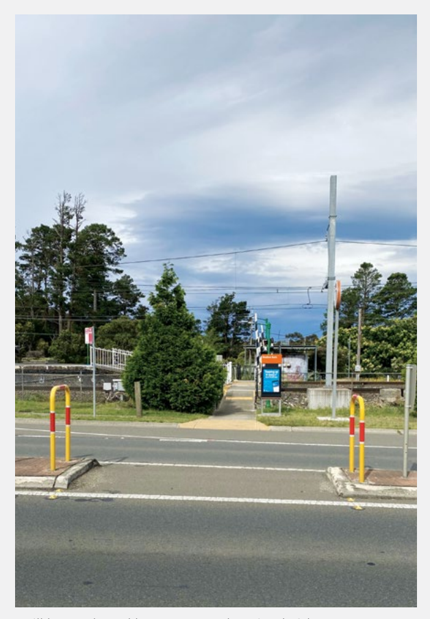
The railway level crossing and pedestrian refuge on the Highway will be replaced by a new pedestrian bridge