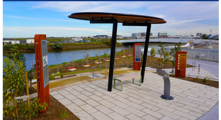
Finishing works on the pedestrian and cycle path..