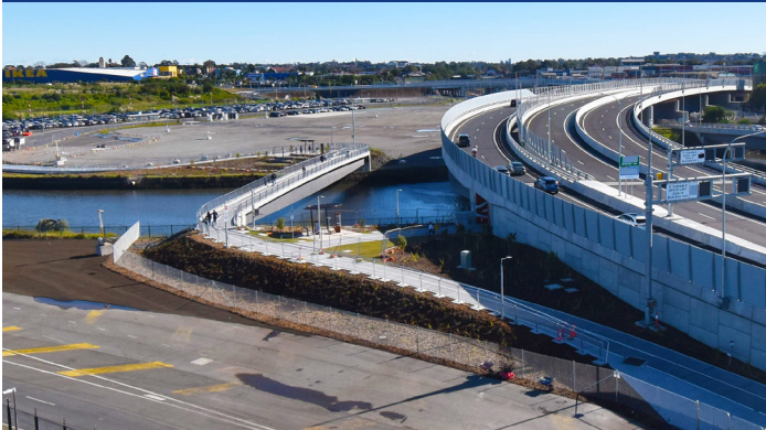
We are laying the final road surface at our Tempe and St Peters sites.