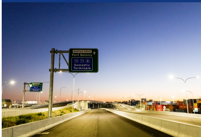
Completing power connections around St Peters.