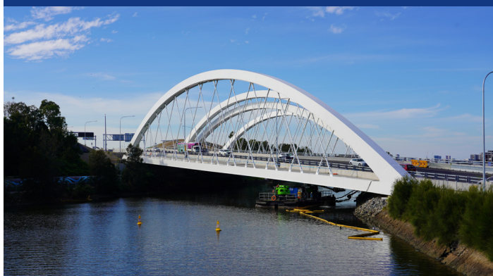
Work continues to the underside of the Twin Arch Bridges.