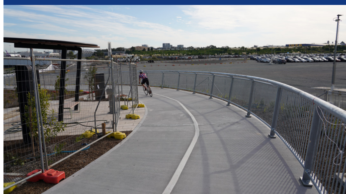
Finishing activities on the pedestrian and cycle path..