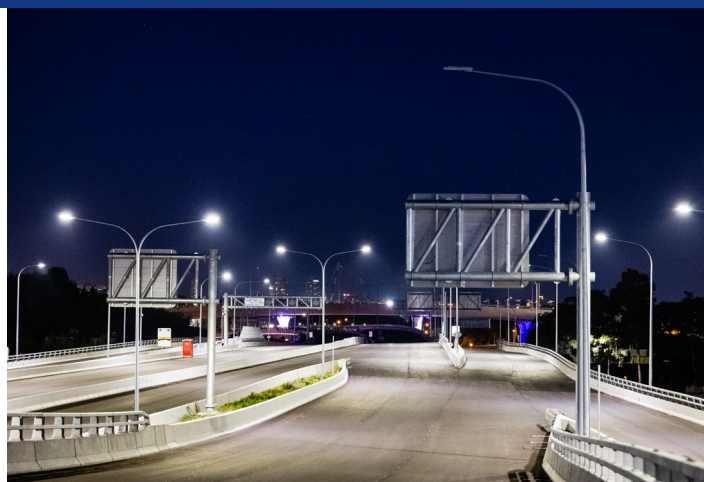
We are laying the final road surface at our Tempe and St Peters sites.