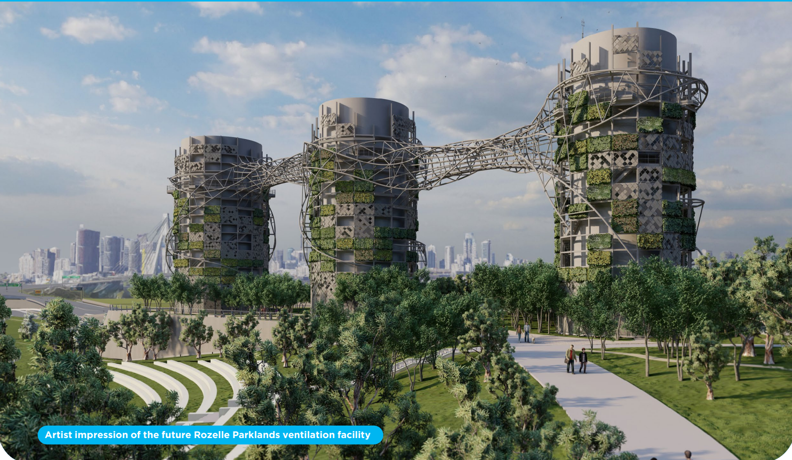
Artist impression of the future Rozelle Parklands ventilation facility

Air quality and human health is a key priority when designing road tunnels.