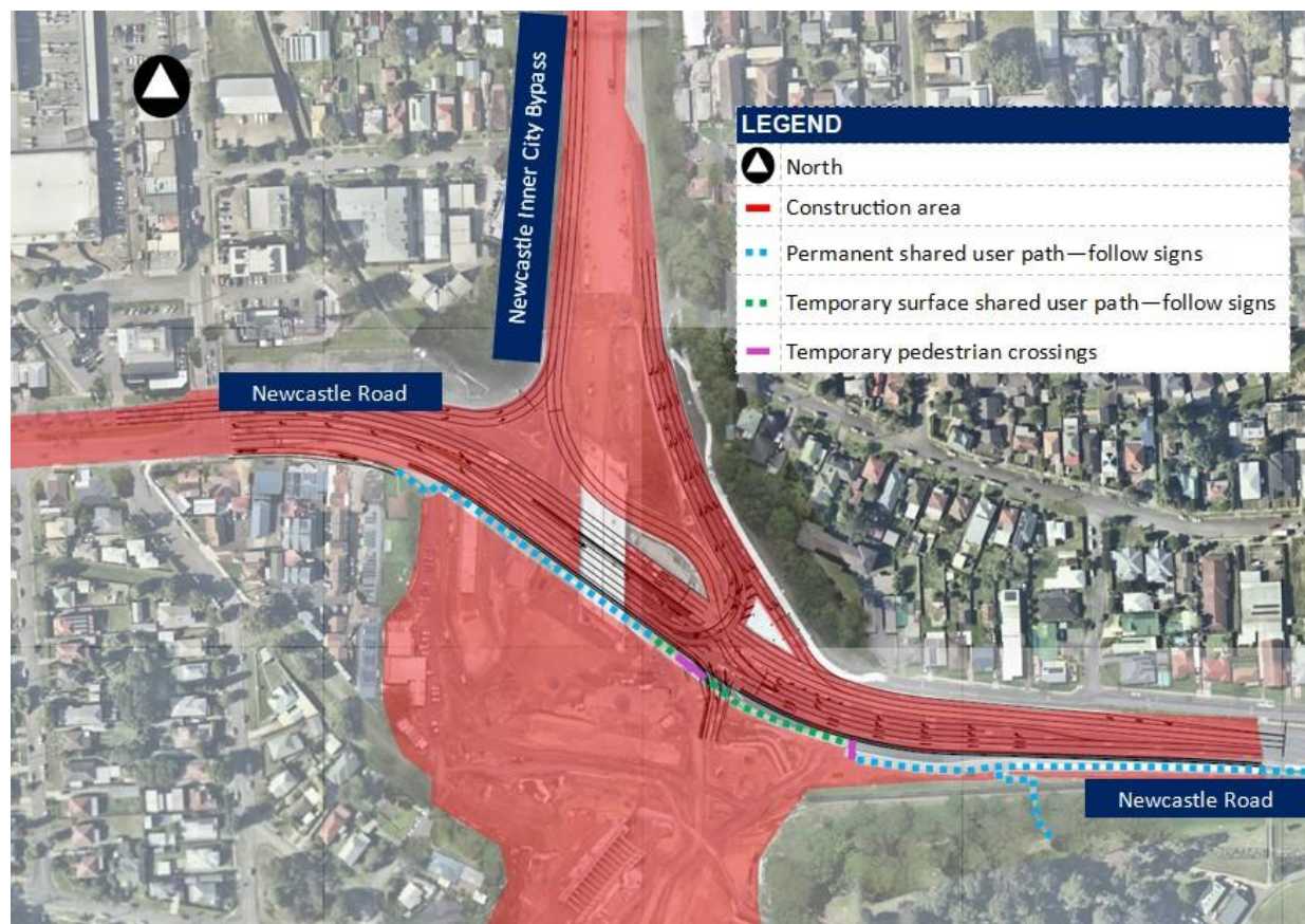
Jesmond - Northern Interchange

This is an artist impression only and is not to scale