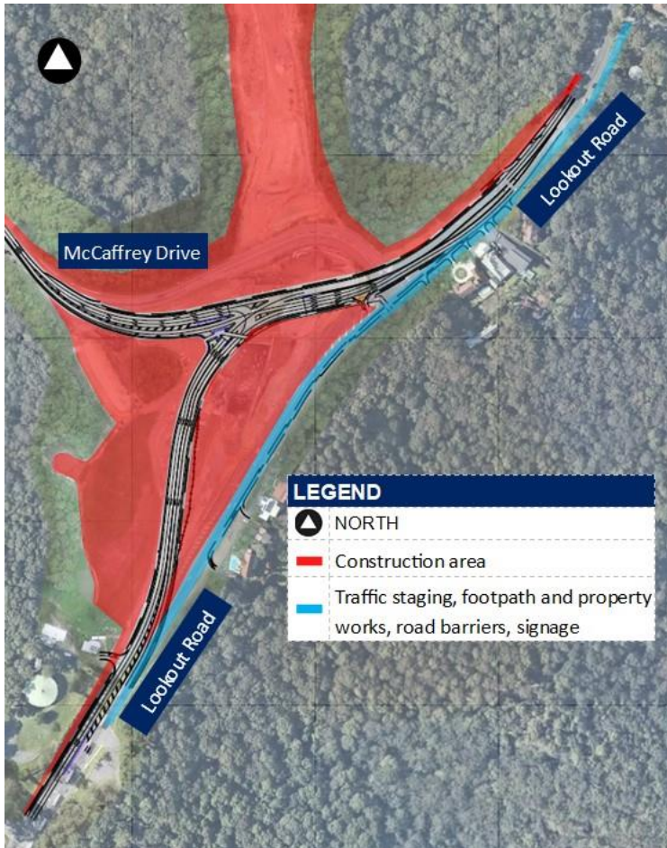
New Lambton Heights - Southern Interchange

This is an artist impression only and is not to scale