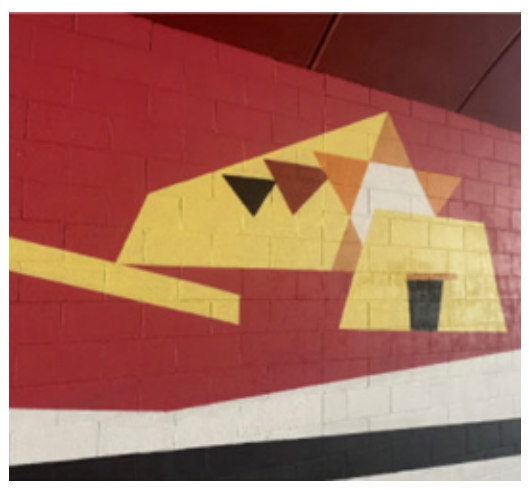
The old Bankstown War Memorial and Synagogue was destroyed in 1991 by fire that was deliberately lit. It has been reprensented in the Time Tunnel .

Some of the motifs in the mural work are of local buildings that no longer exist. One example of this is the old Bankstown War Memorial and Synagogue with its distinctive design.