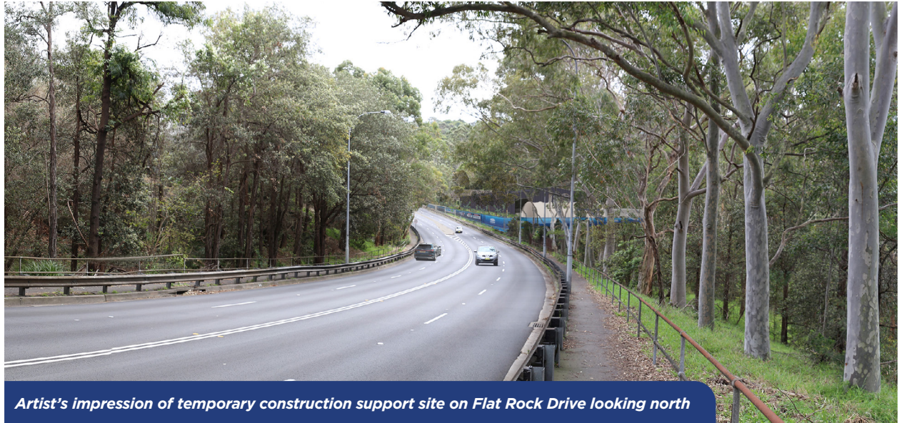
Artist's impression of temporary construction support site on Flat Rock Drive looking north