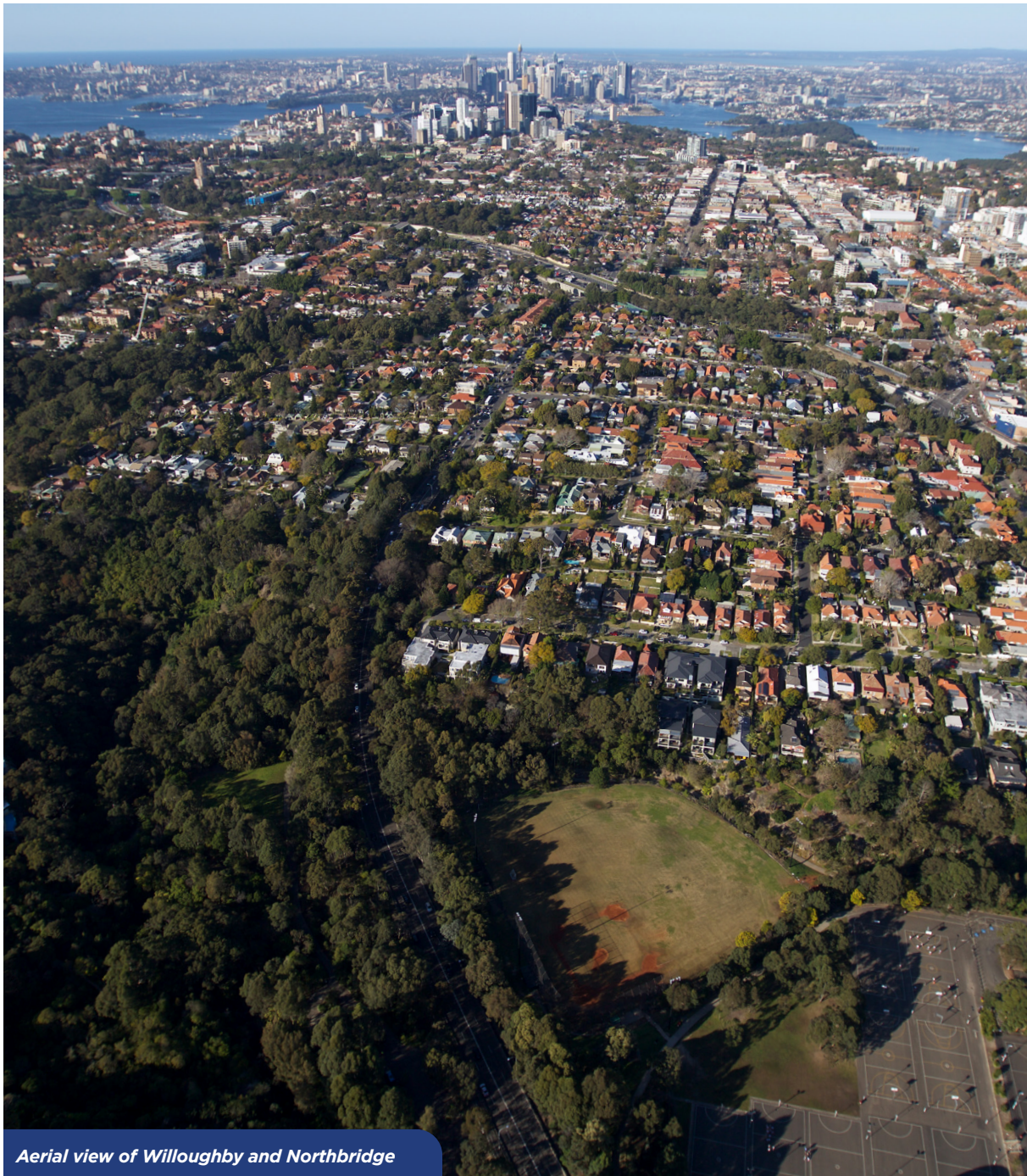
Aerial view of Willoughby and Northbridge