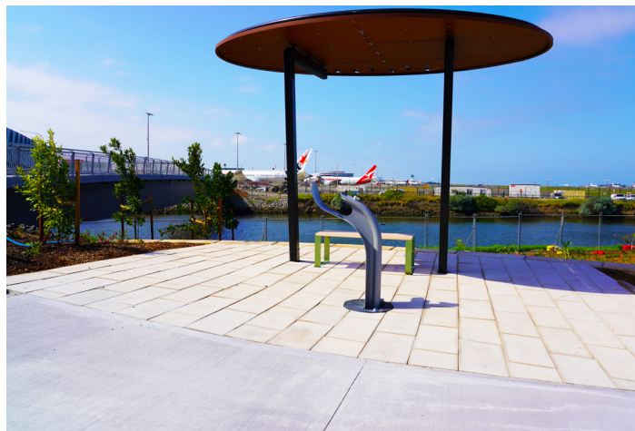
The rest area to the north of Nigel Love Bridge is great for plane spotting.

The other rest area south of Nigel Love Bridge is the transition point along the pedestrian and cycle path, from a canal environment to a roadway environment. As users make this transition, the story of the transformation of the Alexandra Canal, the Botany Rail Line and Sydney Airport is provided on the path's interpretation panels.