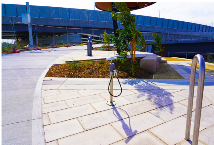
The rest area provides shelter, a bubbler and a bike pump.

The rest area to the north of Nigel Love Bridge is an open area that is great for plane spotting. It has casual, stepped, amphitheatre-like tiered seating and views to the Airport runway. The rest area provides shelter, a bubbler, bike pump, interpretative signage, integrated feature lighting and seating.