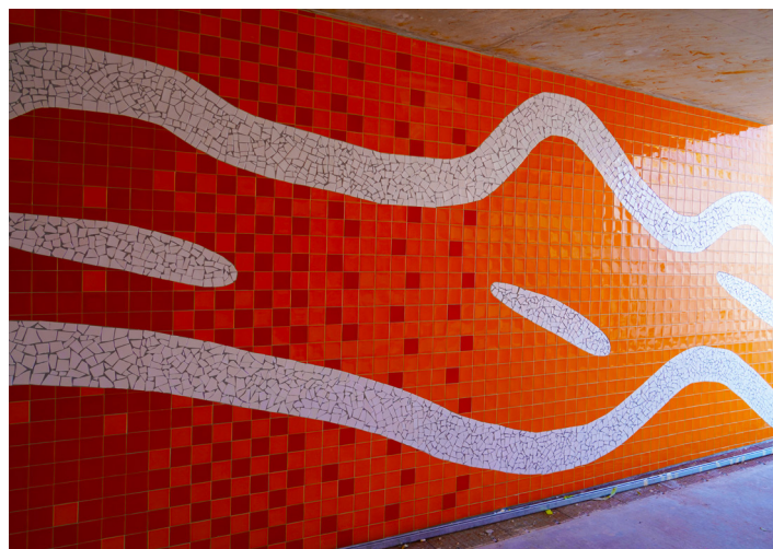
Nigel Love Bridge underpass users will note the ochre tiling.

In the Nigel Love Bridge underpass users will note the ochre tiling. This is a reminder of the 'firefly' story, which tells of the experience of settlers who saw small lights on the Canal water and thought they were fireflies. They later realised that they were Aboriginal women in nawi's (canoes) with small fires in their centres. The colours also remind us of the colours of country and the red earth.