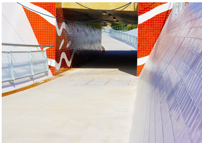
Nigel Love Bridge underpass.

From 7:00am on Friday 12 April 2024 , the Nigel Love Bridge underpass and the pedestrian and cycle path bridge over Alexandra Canal will be opened to path users. This section of the path also showcases some of the urban design and landscaping on Sydney Gateway, which have been developed through a collaborative approach with both Aboriginal and non-Aboriginal input.