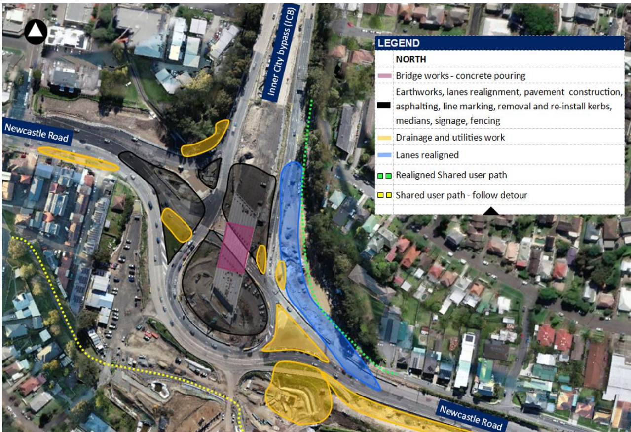
This is an artist impression only and is not to scale.