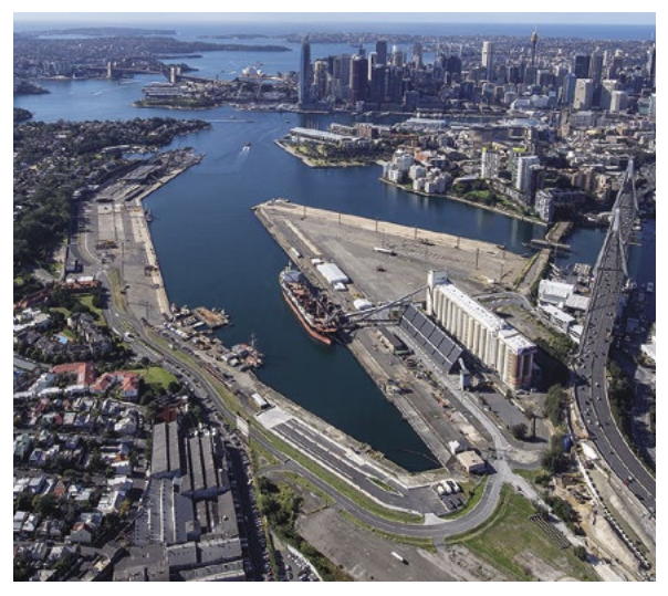
Bays west area.

Online: planning.nsw.gov.au/bayswest Email: bayswest@dpie.nsw.gov.au