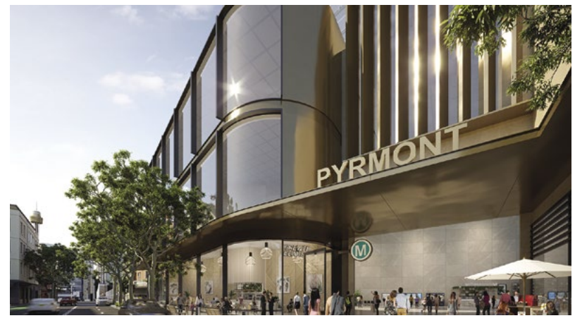
An artist's impression of Pyrmont Station.

Sydney Metro will continue to work with the Department of Planning, Industry and Environment, other government stakeholders and the community to ensure Pyrmont Station supports the future vision of the Pyrmont Peninsula.