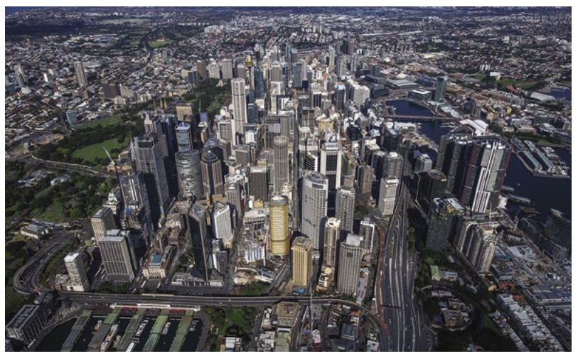
Aerial view of Sydney CBD.

Proposed underground walkways will allow for easy transit all the way from Martin Place to Barangaroo – providing efficient links with Sydney Metro City & Southwest and Sydney Trains services. The new station is expected to have the highest numbers of city-bound customers across the entire Sydney rail network in the AM peak, taking pressure off Wynyard and Town Hall stations.