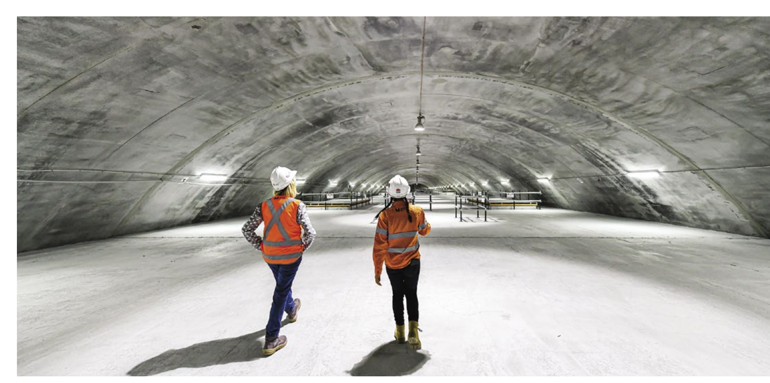
Cavern on the Sydney Metro City & Southwest project.

Two TBMs will be required to carry out the tunnelling between The Bays and Hunter Street and will be launched from The Bays. The TBMs will excavate twin tunnels under the harbour at Johnstons Bay and Darling Harbour, before reaching Hunter Street. The Sydney Metro West tunnels will be 38 metres deep on average – that's about 13 storeys below ground.