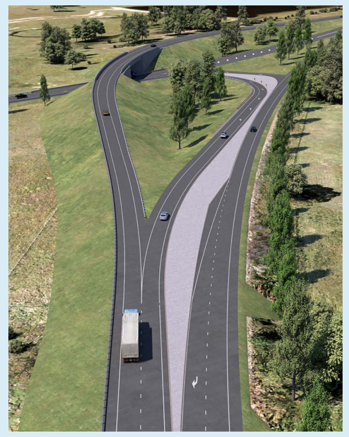
Artist impression of the southern connection, looking south