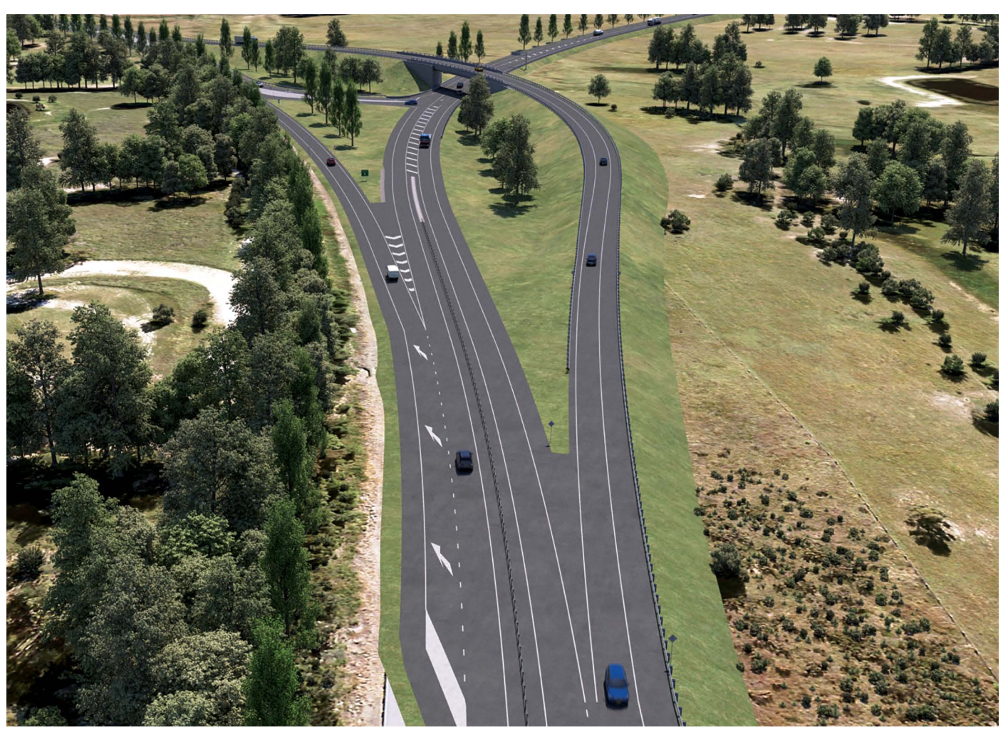
Artist impression of the southern connection, looking north.