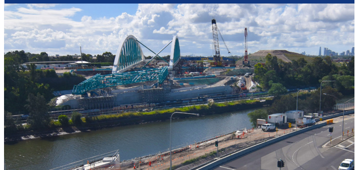
The steel launch nose temporarily attached to the front of the Twin Arch Bridge to facilitate the launch.