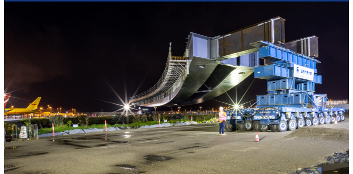
Ongoing bridge construction in St Peters.