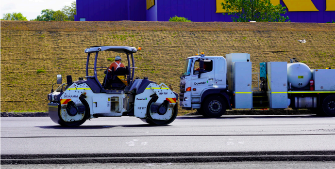
Road support work including asphalting within our Northern Lands work site in St Peters.