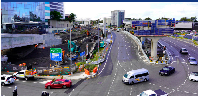
Continuing girder installation on Qantas Drive, Mascot.