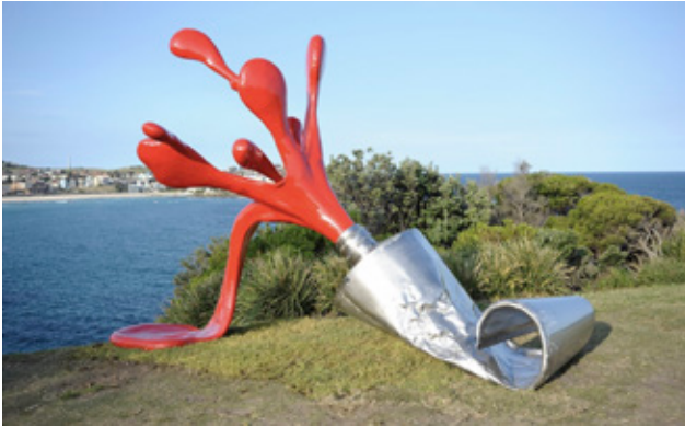
Tomas Misura Splash Sculpture by the Sea, Bondi Beach Sydney (temporary outdoor exhibition) 2010 (Photo: Roger D'Souza https://sculpturebythesea.com/the-clitheroe-foundation-emerging-artists-mentor-program/ ) Date accessed: 5/1/2021