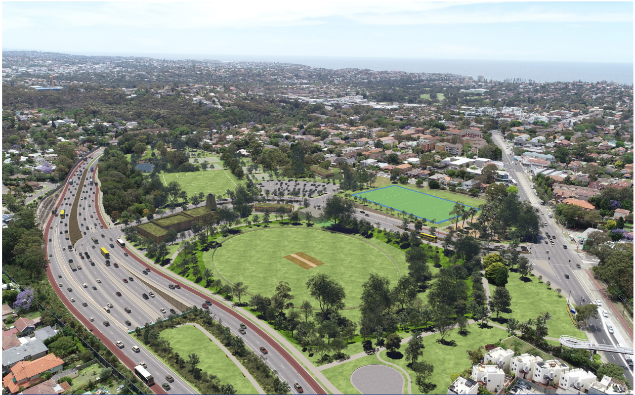
Artist's impression of new and improved open space and recreation facilities at Balgowlah. Indicative only.