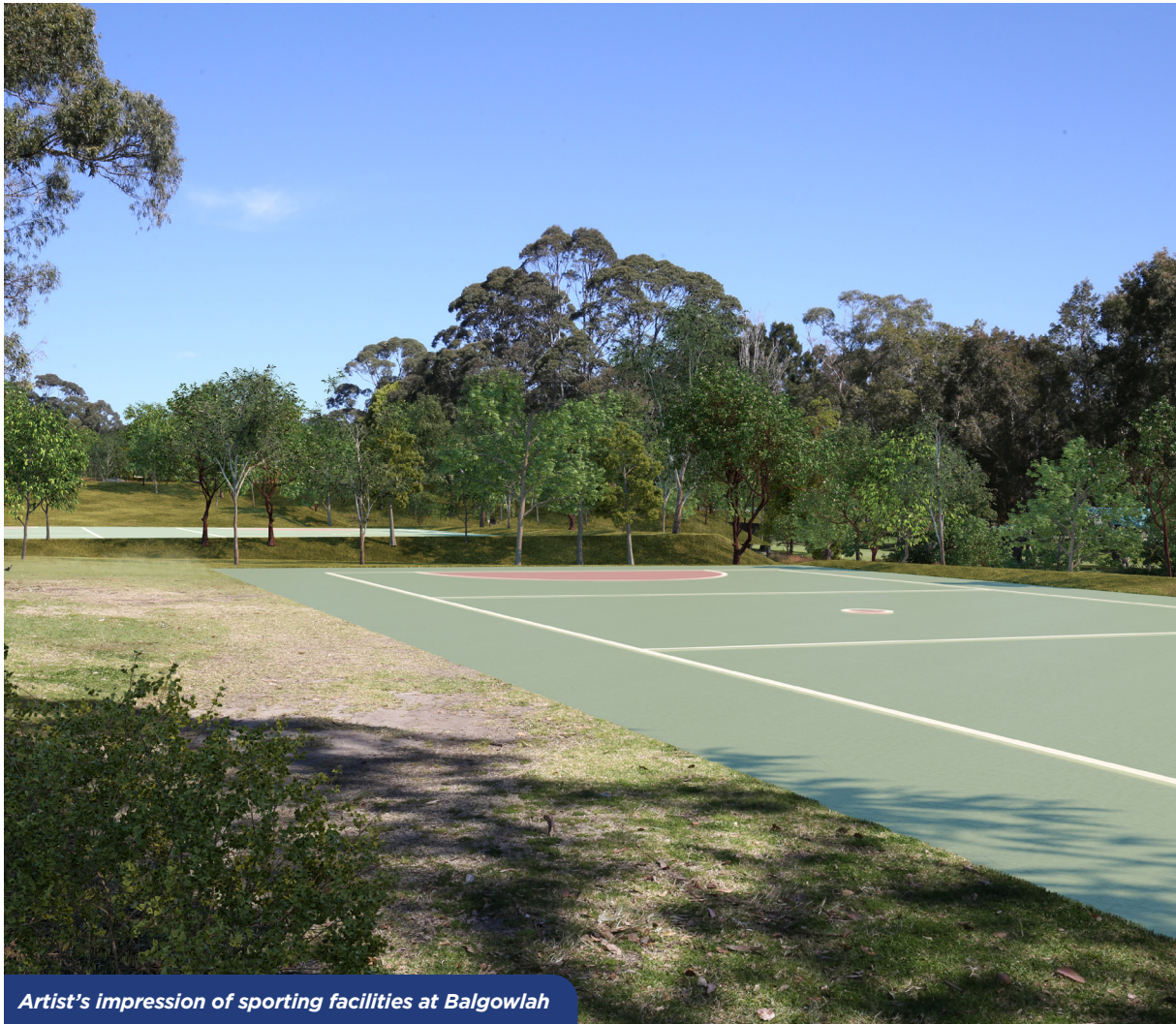
Artist's impression of sporting facilities at Balgowlah