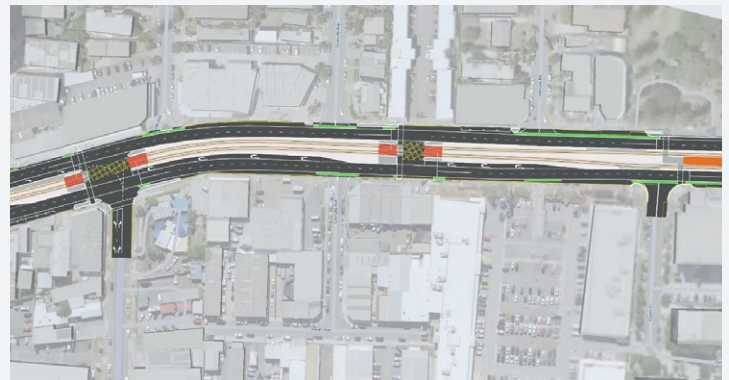
To view the above map in further detail, please visit the GCLR3 interactive website.

Visit the GCLR3 interactive website at www.gclr3.com.au to find out more about where on-street parking will be reinstated after construction.