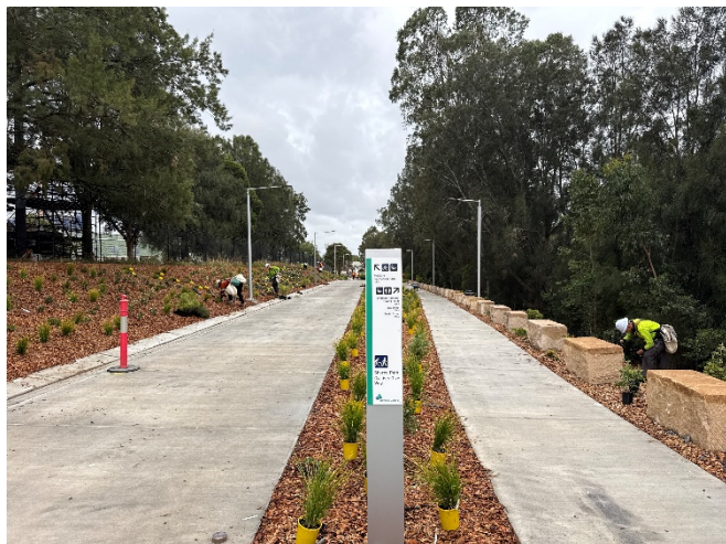
Shared pedestrian and cycle path entrance to the north of President Avenue