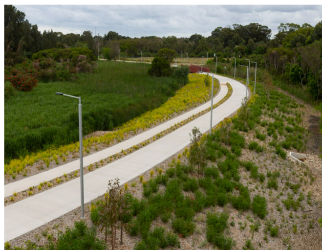
Shared pedestrian and cycle path at Scarborough Park