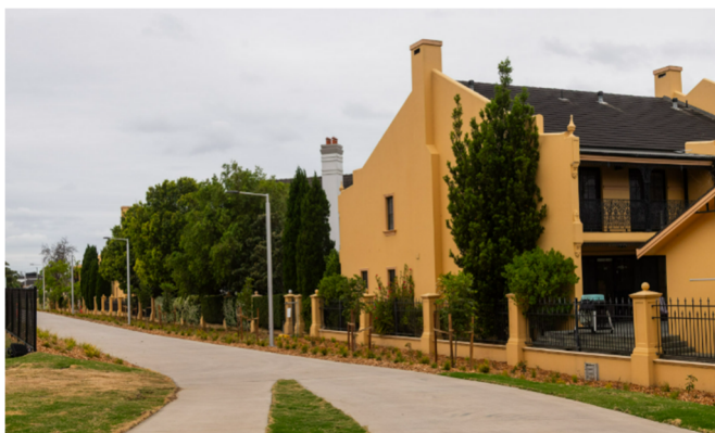
Shared pedestrian and cycle path alongside Brighton Terraces